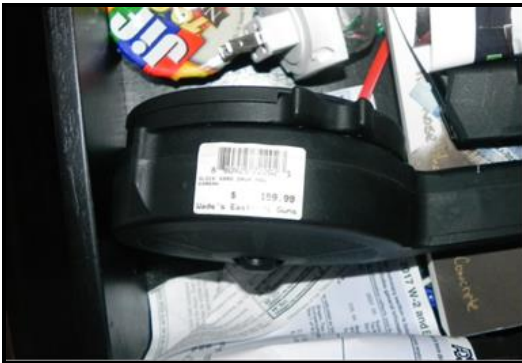
High capacity drum magazine for Glock