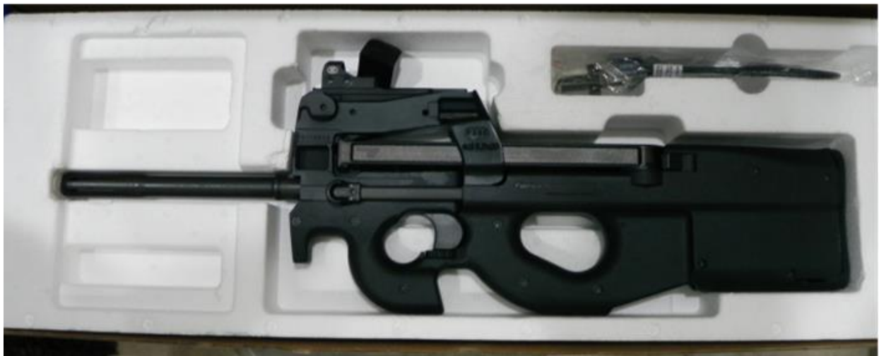
PS-90 PDW – fires rounds designed to puncture body armor