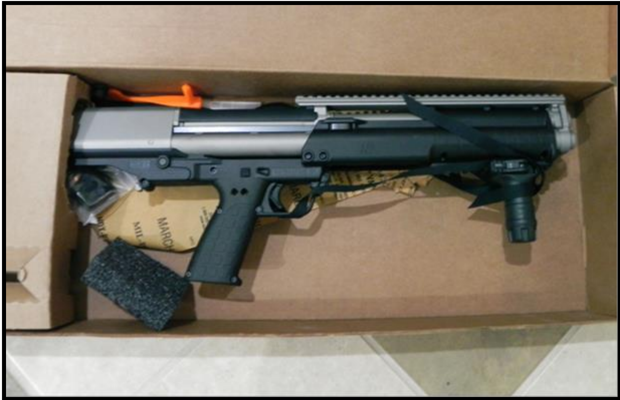
Kel-Tec Tactical/Combat Shotgun