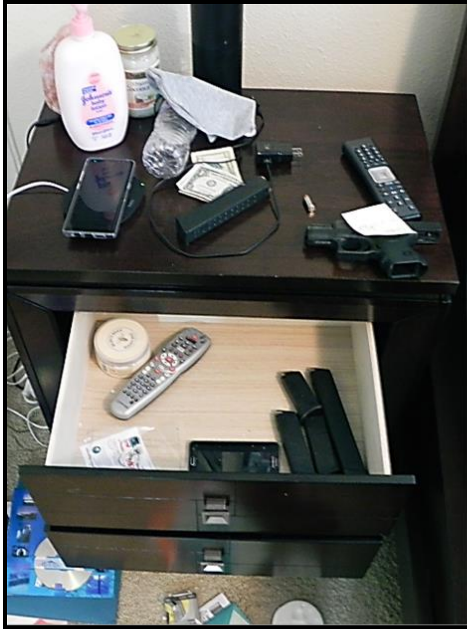
Loaded Glock Pistol with additional loaded regular and extended/high capacity magazines – bedside table