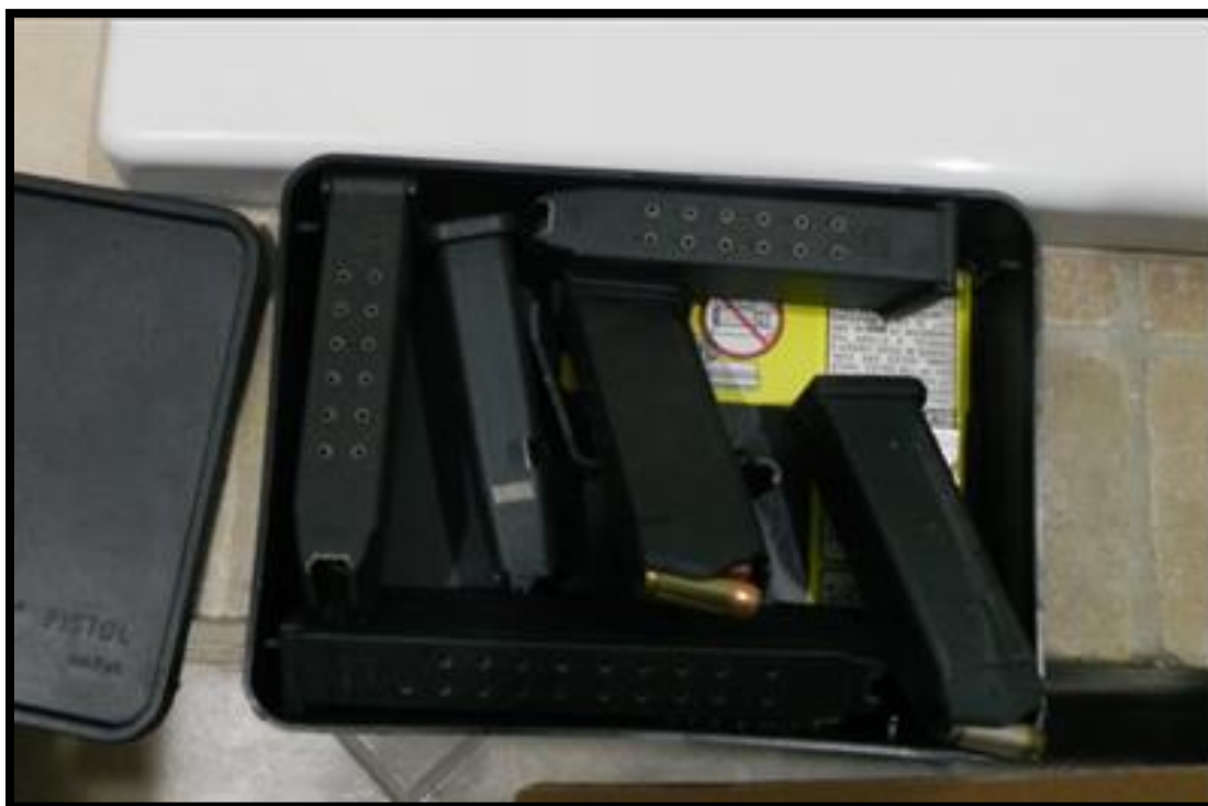
Additional regular and extended magazines for Glock Pistol – Some loaded with rounds