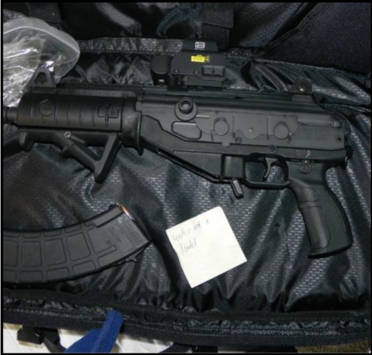
Galil (AK-47 style) assault rifle – under bed – with loaded magazine