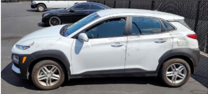
Recovered - BWF4900 White Hyundai Kona