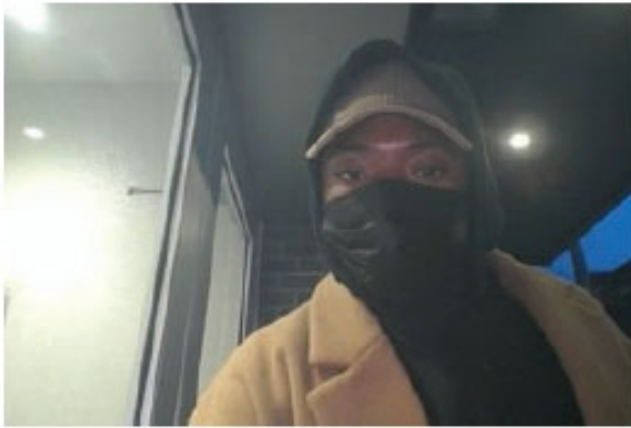
February 22, 2021

f. Based on my review of the still photographs obtained from the doorbell camera associated with Ghahramani's apartment building referenced in paragraphs 6(f)-(g), above (the "Doorbell Stills"), I have observed that the Fatal Courier depicted in the doorbell still and elevator surveillance photograph referenced in those paragraphs, also appeared to enter Ghahramani's building on each of the days that Ghahramani communicated with the 5555 Drug Dispatcher Phone. Still photographs of the Fatal Courier on each of these days are shown below: