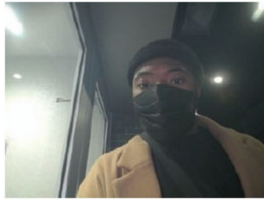
February 23, 2021