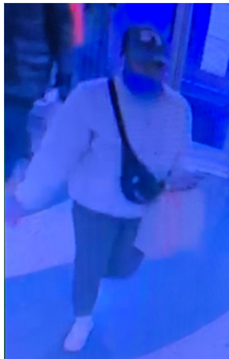
The Drug Dispatcher Phone

p. Surveillance video from the vicinity of Scher's apartment shows that the Fatal Courier - wearing the same outfit shown in the Ghahramani and Mtangi surveillance videos - visited Scher's apartment on or about March 17, 2021, the day before her body was found. A still image from this surveillance video is below: