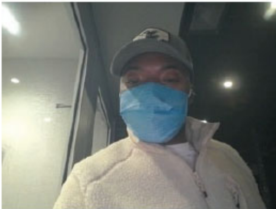
March 9, 2021