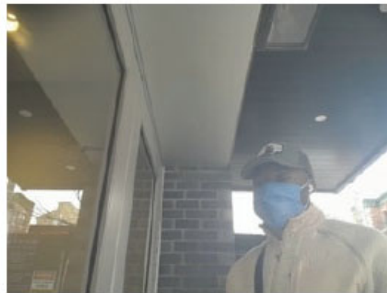
March 17, 2021