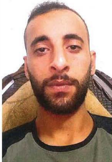
EXHIBIT B TO THE INDICTMENT

) Forfeiture Allegations: ) (18 U.S.C. §§ 982(a)(2)(B) and 1030(i)) ) ) )