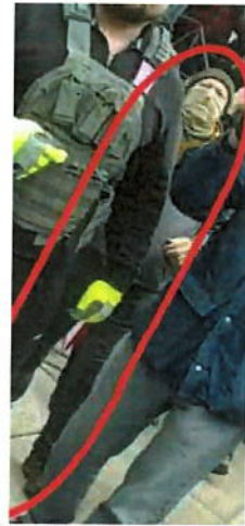
Photograph #466 – AFO A