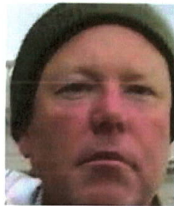
Photograph #466 – AFO C

Additionally, open-source websites referred to AFO #466 as #UnderHelmetSprayer and released the following poster, which included images of AFO #466: