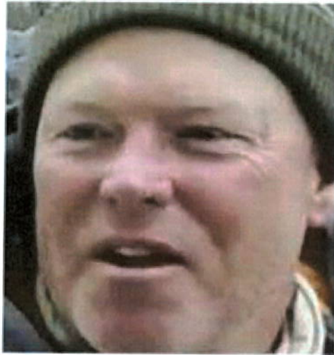
Photograph #466 – AFO D