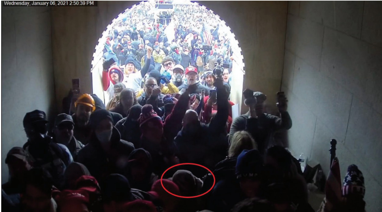
Image 5: Still image from Capitol building surveillance footage at 2:50:39 pm, depicting ASBURY inside the tunnel participating in a heave-ho effort against the police line.

After this first heave-ho effort, ASBURY stood at the mouth of the tunnel for approximately two minutes, with nothing appearing to prevent him from retreating. During that time, he handed a police riot shield to rioters outside the tunnel, as part of an effort to disarm the police, as captured in Image 6 .