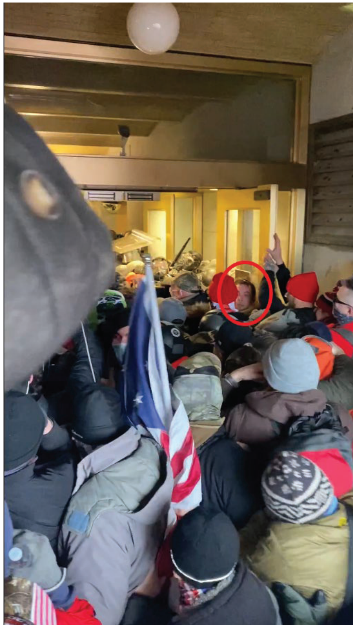
Image 13: Still image from St. Cyr's video depicting ASBURY beyond the doors to the Capitol building at approximately 3:04:07 pm.

The police employed OC spray to disperse the rioters, and many, including ASBURY, turned around to exit the tunnel as a result. He exited the tunnel at approximately 3:05:41 pm.