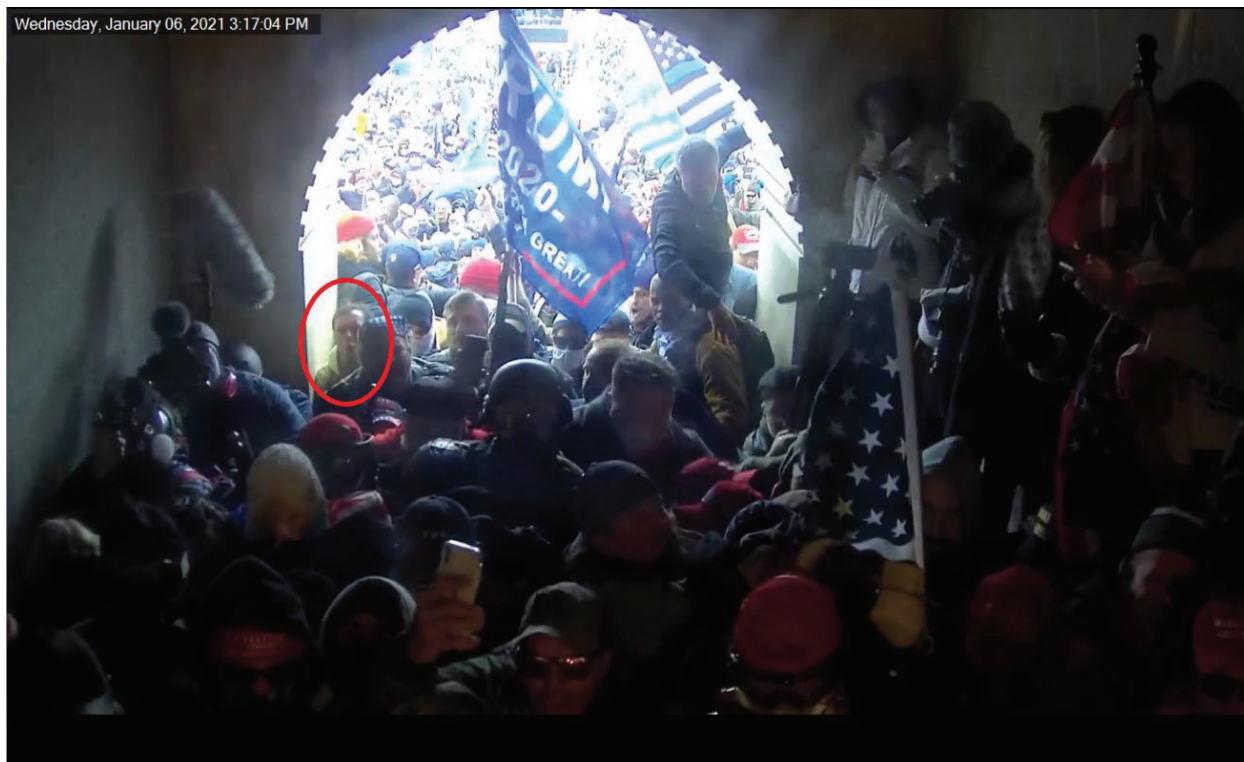
Image 14: Still image from Capitol building surveillance footage at 3:17:04 pm, capturing ASBURY at the mouth of the tunnel.

ASBURY remained at the mouth of the tunnel after exiting. At approximately 3:17:04 pm, Capitol surveillance footage captured ASBURY cheering on the heave-ho effort from the mouth of the tunnel.