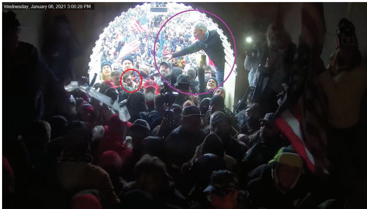
Image 12: Still image from Capitol building surveillance footage at 3:00:28 pm, depicting ASBURY (red) and Mehaffie (purple) at the mouth the tunnel.

At approximately 3:00:28 pm, ASBURY was standing at the mouth of the tunnel and engaged in conversation with David Mehaffie, 4 dubbed #tunnelcommander by citizen sleuths online, due to his having directed the movement of the rioters inside the tunnel. As captured in Image 12 , Mehaffie pointed in the direction of ASBURY, said something, and ASBURY nodded his head “yes” and responded. 5 ASBURY stood at the mouth of the tunnel for approximately two minutes, with the apparent capability to leave the premises. Despite this, he re-entered the tunnel at approximately 3:02:04 pm.