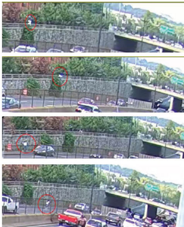
Image 4 – BAILEY, circled in red, jumping down the wall onto I-295

RSU members gave chase as BAILEY ran through the DC Public Housing Complex in the 4400-4500 blocks of Quarles Street Northeast. BAILEY jumped the retaining wall in the 1600 block of Kenilworth Avenue Northeast that borders Interstate 295 and landed in the southbound lane of I-295. See Image 4.