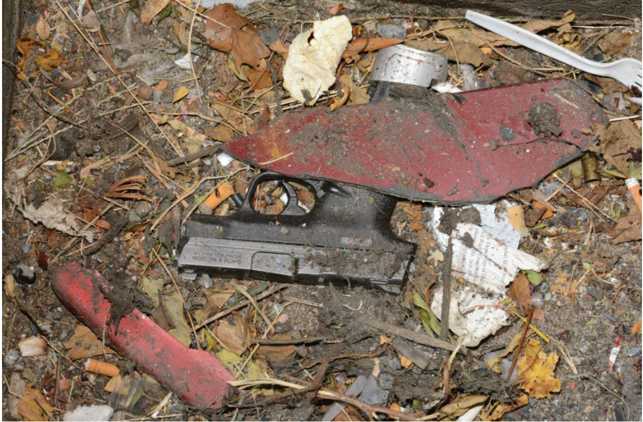
Image 6 – The Smith & Wesson as it was discovered in the storm drain