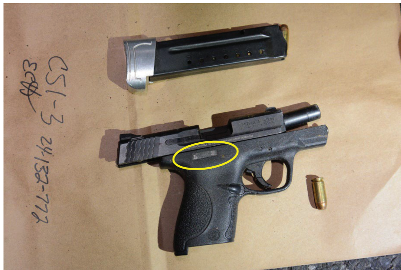
Image 7 – Obliterated serial number just below the slide on the handle (in yellow)