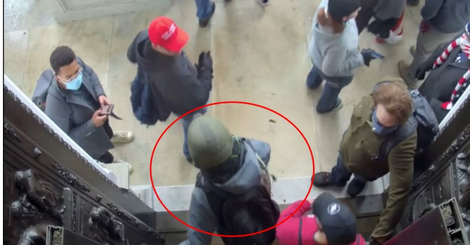
Image 12: LUTSIK exiting the U.S. Capitol at approximately 2:45 p.m.