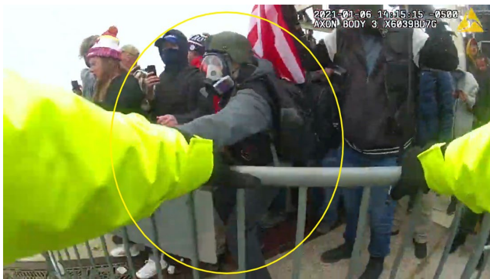
Image 7: LUTSIK pulling a bike rack police barrier from law enforcement officers.