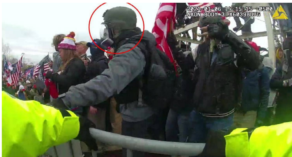
Image 6: LUTSIK pulling a bike rack police barrier from law enforcement officers.