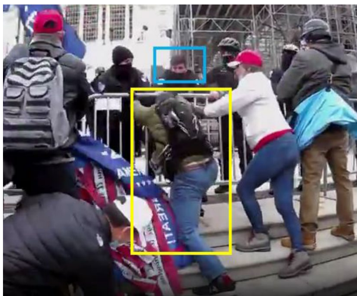
Image 3: Open-source footage of the subject pushing a barricade into officers.