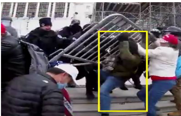
Image 4: Open-source footage of the subject struggling with officers over the barricade in an attempt to breach the police barricade.

After this incident, the subject remained on Capitol grounds as the riot developed. At approximately 2:11 p.m. open-source footage and U.S. Capitol Police surveillance cameras (or “CCTV”) captured the subject on the West Front deploy a fire extinguisher toward a police line assembled to stop rioters from advancing on Capitol grounds. Image 5 and 6 capture the subject’s actions at this location.