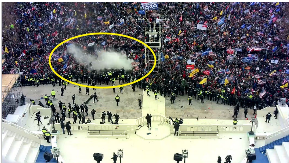
Image 6: CCTV footage of the cloud resulting from the subject's use of the fire extinguisher.

While he was on the West Front, the subject moved to a media tower assembled for the upcoming inauguration. Once the subject arrived at the media tower, the subject climbed the tower and, once at the top, waived a “Three Percenters” 1 flag above the mob in a manner that appeared to display triumph and solidarity with other rioters.