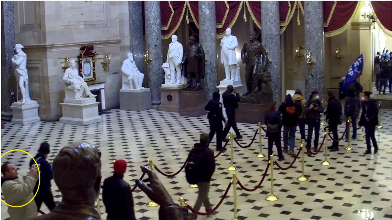
Figure 4: Still image of ROWBOTTOM (circled in yellow) in Statuary Hall on the second floor of the U.S. Capitol building at approximately 2:31 p.m. on January 6, 2021

Further camera footage from inside the Capitol building showed ROWBOTTOM inside Statuary Hall at approximately 2:31 p.m. and 2:51 p.m. ( Figure 4 ) ( Figure 5 )