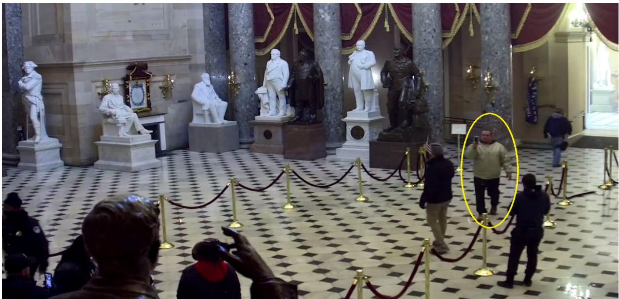
Figure 5: Still image of ROWBOTTOM (circled in yellow) in Statuary Hall on the second floor of the U.S. Capitol building at approximately 2:51 p.m. on January 6, 2021