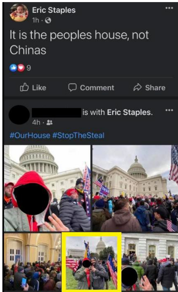
Image 3 – Screen Shot displaying January 6, 2021, posts from STAPLES’s Facebook profile page; A yellow box has been placed around the photograph of STAPLES and Defendant 1, which was referenced above at Image 2

Based on my review of video evidence taken in and around the Capitol complex on January 6, I understand that, throughout the day of January 6 th , some rioters present at the Capitol chanted or shouted “our house” or “the people’s house,” in reference to the Capitol building.