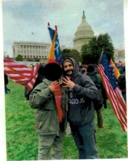
Image 5 – Copy of Photograph Posted to Defendant 1’s Facebook Page, Shown to STAPLES during December 2021 interview

STAPLES stated that he deleted his Facebook account shortly after leaving the Capitol.