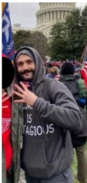
Image 2 – Zoomed-in image of Defendant 1’s Facebook post shown in Image 1, showing STAPLES, as identified by tipster

The tipster also provided a post from Defendant 1 in which STAPLES was tagged. The tipster identified STAPLES in a picture within the post, which showed Defendant 1 and STAPLES standing together with the U.S. Capitol in the background. A reproduction of this image that has been cropped to show STAPLES is provided below.