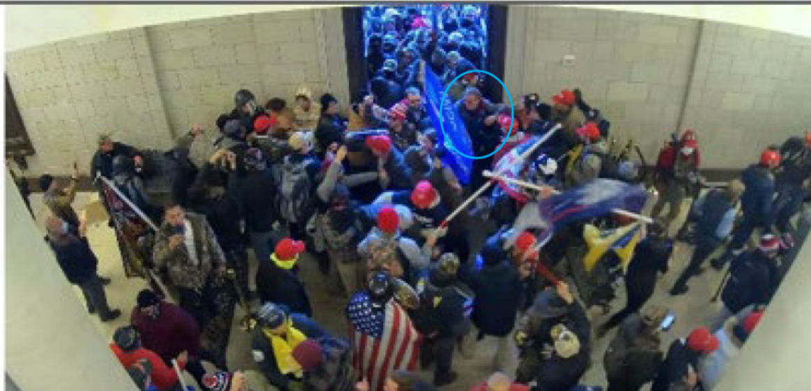
Image 14: Still image from CCTV of the U.S. Capitol on January 6, 2021, with MARSHALL circled in blue

At approximately 2:41 pm MARSHALL went up the Gallery Stairs of the U.S. Capitol. Image 15 is a screenshot of MARSHALL circled in blue: