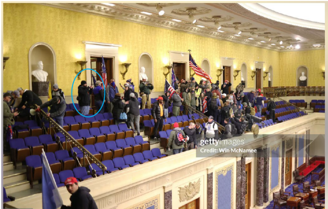
Image 16: Still image from open-source media of the U.S. Capitol on January 6, 2021, with MARSHALL circled in blue

At approximately 2:51 pm, MARSHALL exited the Senate Carriage Door of the U.S. Capitol. MARSHALL was inside the U.S. Capitol for approximately 15 minutes.