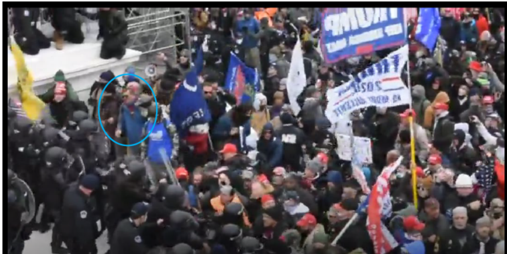
Image 7 and 8: Still image from CCTV of the U.S. Capitol on January 6, 2021, with MARSHALL circled in blue and yellow:

At approximately 1:11 pm, MARSHALL pushed and shoved law enforcement officers in the location of the West Plaza. A screen shots of the CCTV footage at 1:11 pm ( https://archive.org/details/ex-508.h-264 , timestamp 34 seconds) taken from open-source research are below (Images 7 and 8). MARSHALL is circled in blue in Image 7 and in yellow in Image 8.