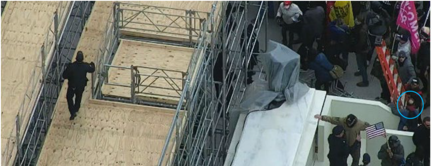
Image 6: Still image from CCTV of the U.S. Capitol on January 6, 2021, with MARSHALL circled in blue

At approximately 1:11 pm, MARSHALL pushed and shoved law enforcement officers in the location of the West Plaza. A screen shots of the CCTV footage at 1:11 pm ( https://archive.org/details/ex-508.h-264 , timestamp 34 seconds) taken from open-source research are below (Images 7 and 8). MARSHALL is circled in blue in Image 7 and in yellow in Image 8.