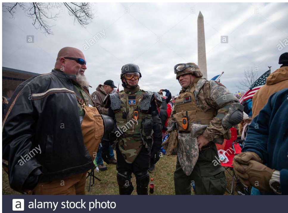
(Image 10: photo of RICHMOND from open source, publicly found photographs taken on January 6, 2021.)