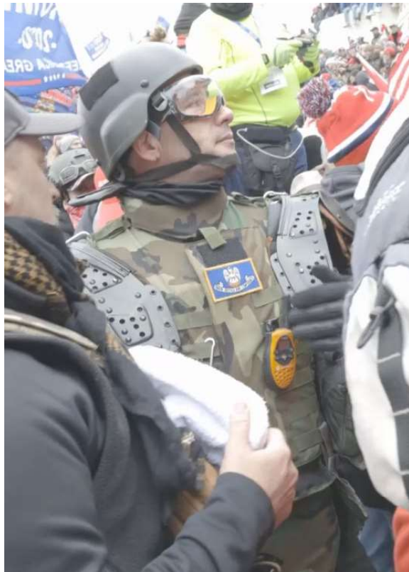
(Image 11: still of RICHMOND from FBI obtained footage on January 6, 2021.)