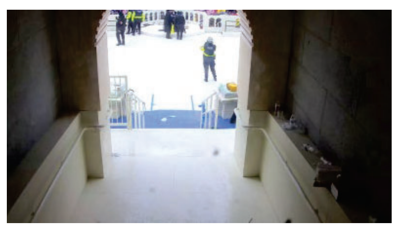
Image 2 (The "Tunnel" as seen on CCTV footage prior to rioters entering)