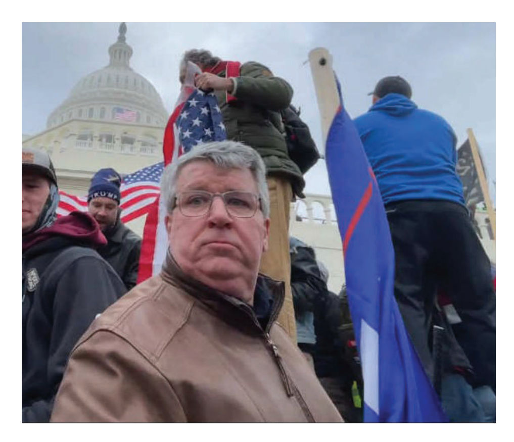
Figure 1: Still image of GATES on the West Plaza of the U.S. Capitol building on January 6, 2021.