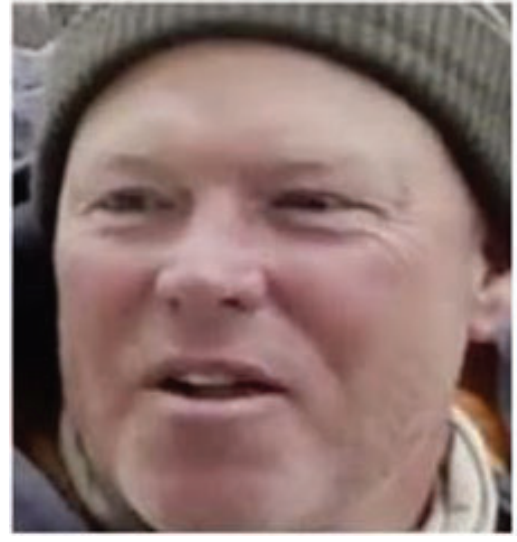
Photograph #466 – AFO D