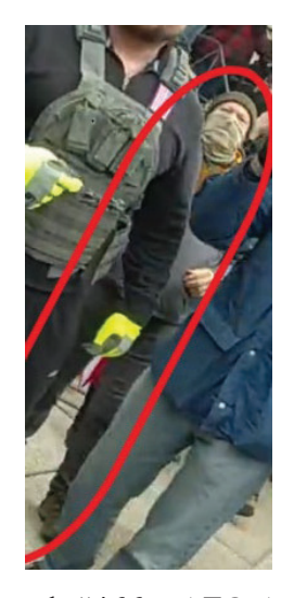
Photograph #466 – AFO A