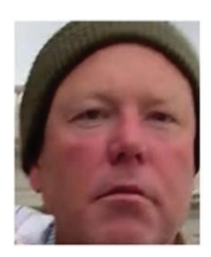
Photograph #466 – AFO C

Additionally, open-source websites referred to AFO #466 as #UnderHelmetSprayer and released the following poster, which included images of AFO #466: