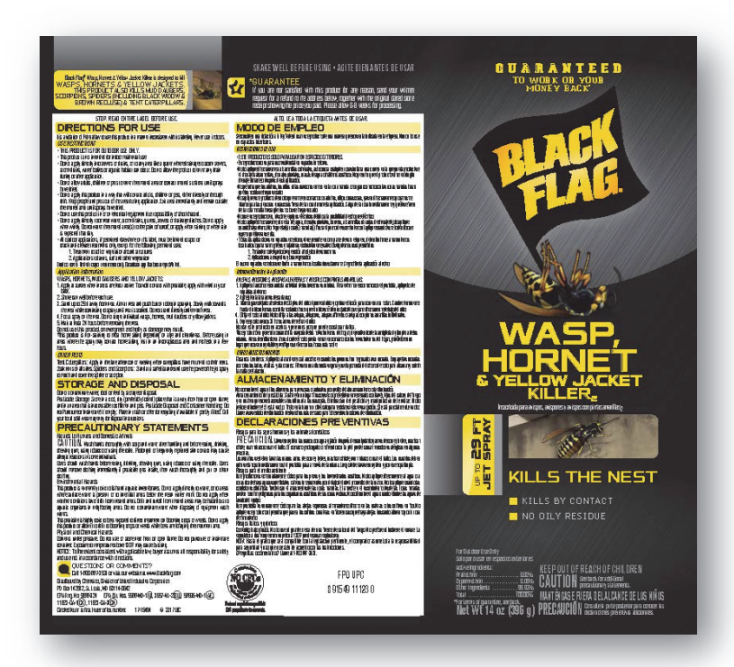
Image 27: An image from the blackflag.com website (https://www.blackflag.com/products/outdoor-products/wasp-hornet-yellow-jacket-killer.aspx) showing the full label of their Black Flag® Wasp, Hornet & Yellow Jacket Killer2 aerosol spray. The label matches the can held by Peter G. Moloney.