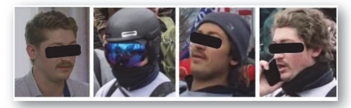
Images 2a-2d: ( l to r ) A series of four screenshots including one screenshot from a publicly available interview with Colleague 1 promoting their business, in which Colleague 1 identified himself by name (circa May 2021) (2a); and three cropped screenshots of Colleague 1 on January 6, 2021 (2b, 2c, and 2d).