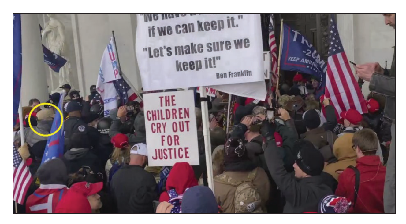
Then, DYKES attempted to hold open the Columbus Door on the Capitol's east side as law enforcement officers attempted to secure the area: