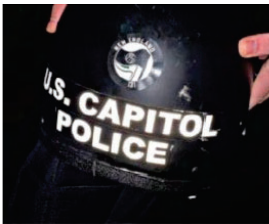
Image 1: Image from the online tip of what appears to be a Capitol Police Helmet with a New England 131 sticker affixed to it

On or about January 8, 2021, the FBI received an online tip that included a picture of what was believed to be a U.S. Capitol Police helmet defaced with a sticker affixed to the helmet. The helmet is black with U.S. Capitol Police lettering in white on the back side of the helmet. A small circular sticker with the words “New England 131” along with a black flag appears to have been placed on the helmet above the lettering: