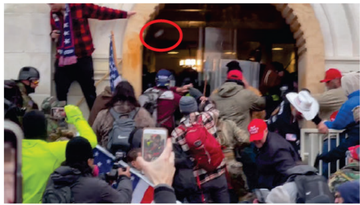
Image 12: Screenshot from the 410pm.mp4 video with a water bottle (circled in red) before hitting the Archway.

At this moment, the 410pm.mp4 video, shows a water bottle being thrown into the Tunnel, first hitting the Archway and then hitting an officer: