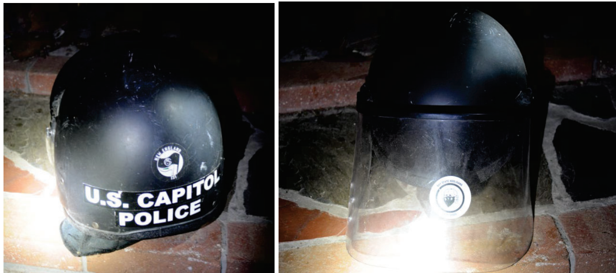
Images 3 and 4: Photographs of the front and back of the helmet recovered from Ackerman's bedroom

bedroom, located the fireplace, and found a U.S. Capitol Police helmet tucked inside the chimney flue.