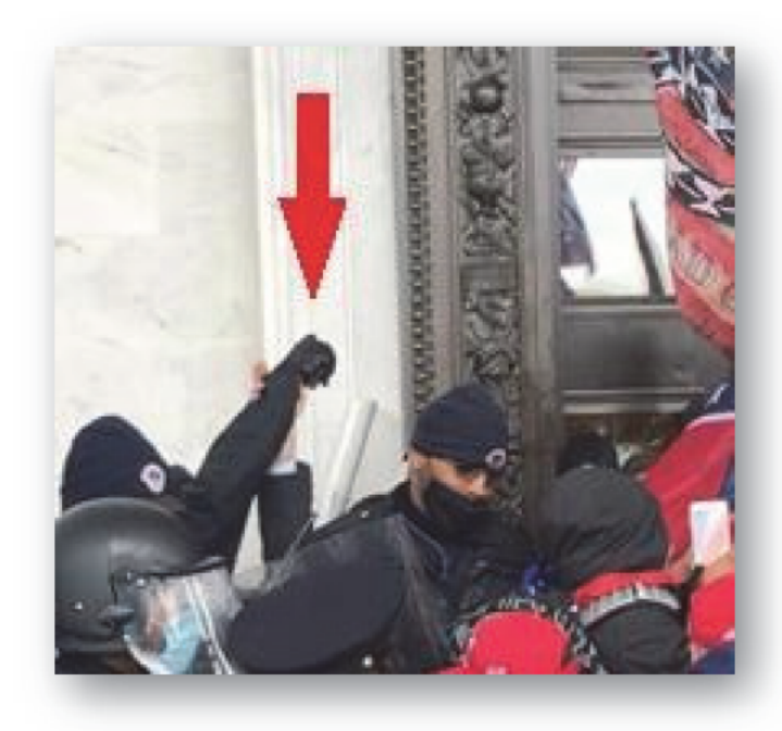
Image 4d —A close-up of the screenshot from the Parler Video which shows the moment when RESNICK reached up and grabbed the wrist of a USCP officer.