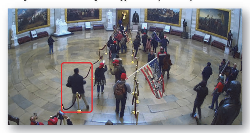
Image 11—A screenshot from USCP CCV showing RESNICK in the Grand Rotunda stepping over a velvet rope between stanchions.

RESNICK turned back north, went back through Statuary Hall, and USCP CCV captures RESNICK entering the Grand Rotunda again at approximately 2:30:28 p.m.