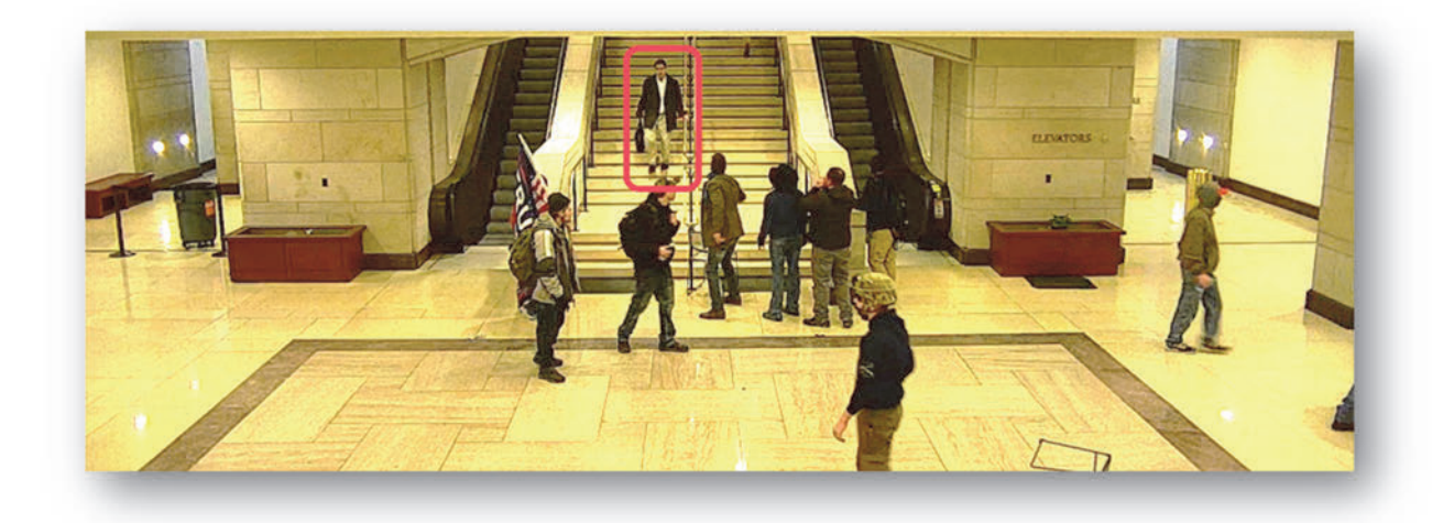
Image 13—A screenshot from USCP CCV showing RESNICK descending into the underground CVC.

At approximately 2:39:25 p.m., RESNICK returned to the Crypt. RESNICK then went to a door that led out of the Capitol (the Law Library Door), and pushed on it. The door opened and RESNICK looked outside. He then returned to the Crypt and went back down to the CVC. After descending into the CVC a second time at approximately 2:41:48 p.m., RESNICK turned north and encountered a group of rioters. He stayed with them for a few minutes and then returned upstairs to the Crypt at approximately 2:44:56 p.m.