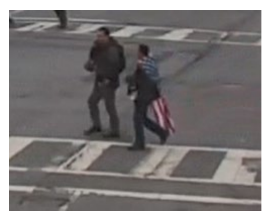
Figure 14: The CORDONs on First St, SE.

• 3:03 PM: The CORDONs depart north along First Street, SE.