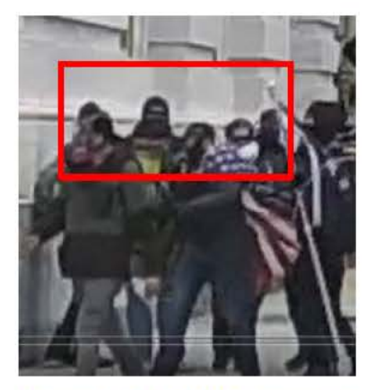
Figure 3: The CORDONs wearing masks after approaching gathering with police officers.

2:16 PM: The CORDONs arrive on the north side of the Upper West Terrace, toward a gathering of individuals that included police officers. K. CORDON is wearing a black gas mask, and S. CORDON is wearing a respirator mask. The CORDONs walk away from the police officers. They later take off their masks and walk toward an entrance to the Capitol Building.