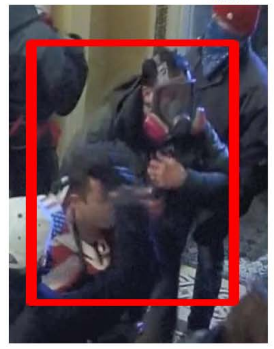
Figures 8: The CORDONs entering the Capitol building.

The CORDONs entry is consistent with statements K. CORDON made in his Ilta Sanomat interview that "they broke into the windows and uh there was people scuffling with the cops and