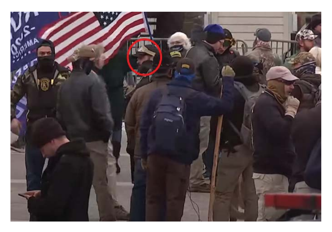
Roberto Minuta's Obstructive Actions After January 6, 2021