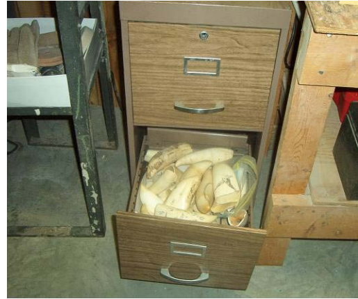
Sperm Whale Teeth Found in Drawer