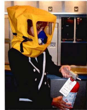
Protective Breathing Equipment

MAI is a charter airline with a fleet of approximately nine aircraft that transported public and private-sector clients around the world. As part of its business activities, the defendant used various pieces of equipment on