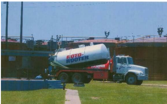
Roto Rooter Truck