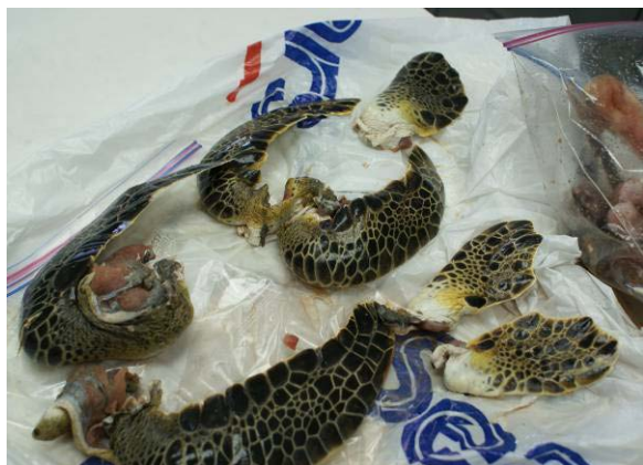
Green Turtle Parts

On January 31, 2011, two men were sentenced after pleading guilty to Endangered Species Act violations for possessing meat from a green sea turtle, an endangered species. Alfredo Velez Camaño will complete a one-year term probation with a special condition of four months’ home confinement. Carlos Diaz Rivera will complete a one-year term of probation. A fine was not assessed; however, both men will complete a two-hour environmental awareness course offered by the USFWS.