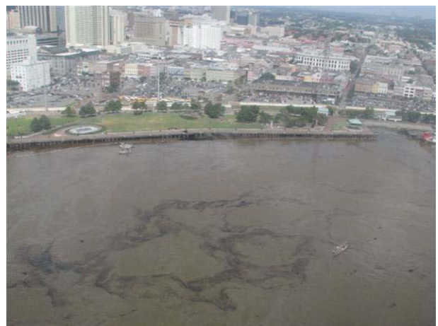
Oil Spill after Collision

DRD owned and managed tugboats that pushed barges for other companies. On July 23, 2008, the DRD-owned M/V Mel Oliver , which was pushing a tanker barge full of fuel oil, crossed paths with the M/T Tintomara , a 600-foot Liberian-flagged tanker ship, causing a collision that resulted in the negligent discharge of approximately 282,686 gallons of fuel oil from the barge into the Mississippi River.