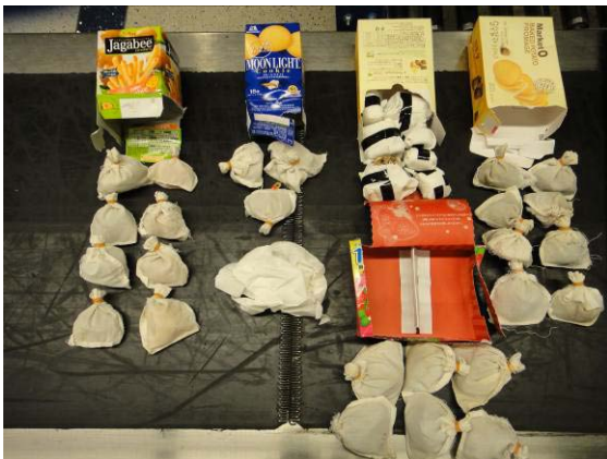
Concealed turtles and tortoises

Indian Star tortoises, Chinese Big Headed turtles, and Malayan Snail-eating turtles, all of which are CITES-protected species.