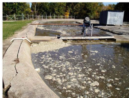
Crumbling Aeration Basin

The jury found Pruett and LLWC guilty of six felony CWA violations for failure to maintain and provide records pertaining to all of the impacted subdivisions. Pruett and LLWC also were convicted of one felony count for effluent violations at one specific subdivision. Pruett additionally was found guilty of a misdemeanor CWA violation for failure to properly operate and maintain one of