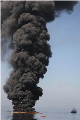
Burning oil spill