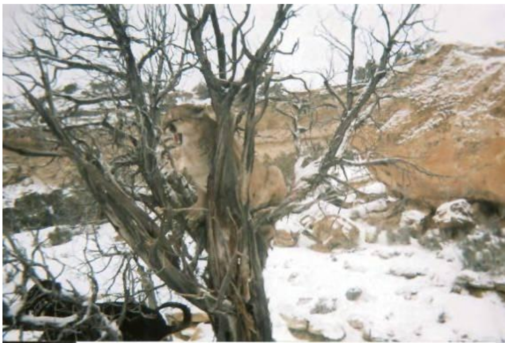
Photo of a Mountain Lion in a Tree. See United States versus Loncarich et al. , below, for more details.