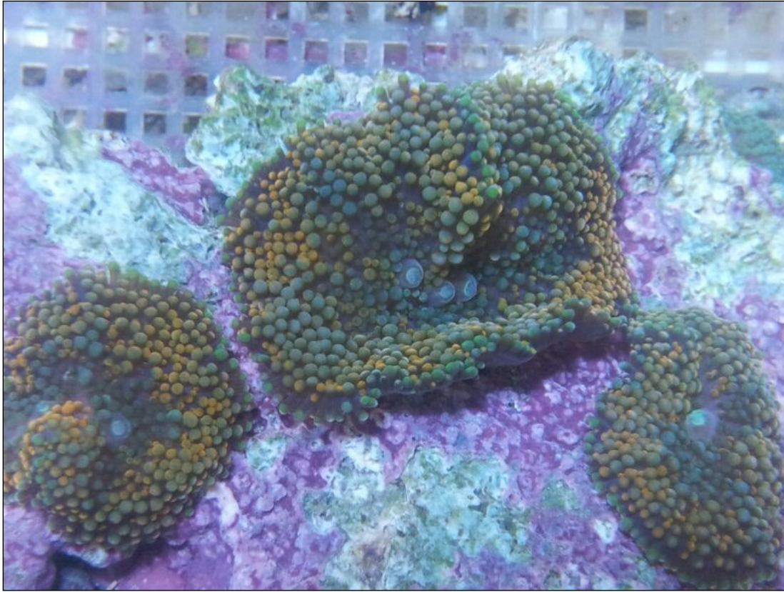
Photo 1. Ricordea polyps illegally harvested by the defendant for use in the aquarium trade. Notice that the polyps are still attached to reef substrate.