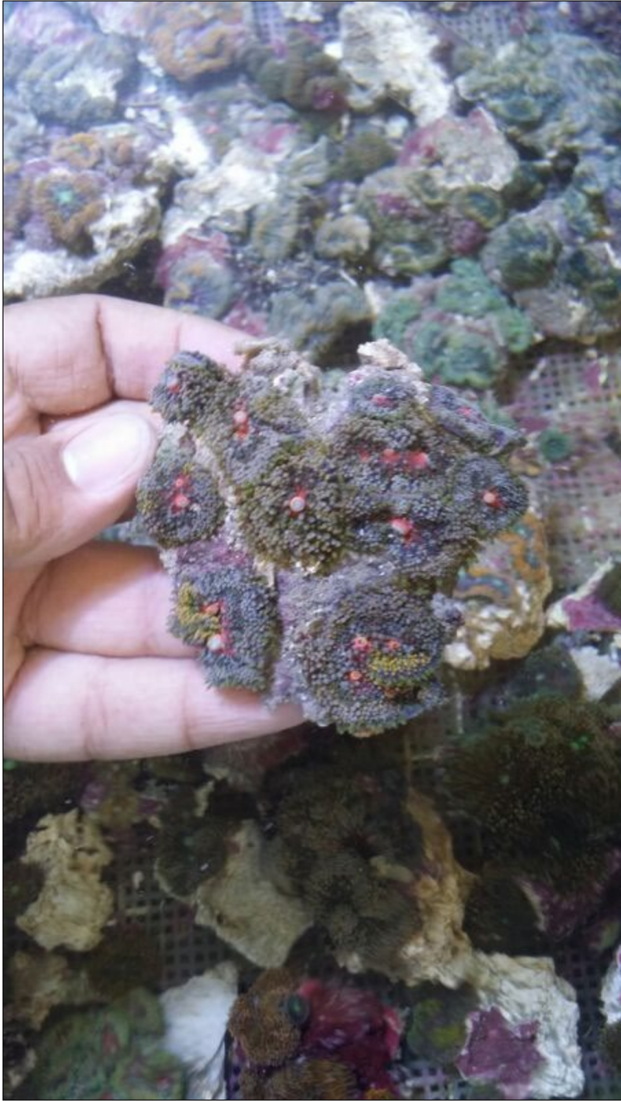
Photo 2. Ricordea polyps illegally harvested by the defendant. Photo shows other specimens in one of the business' saltwater tanks.