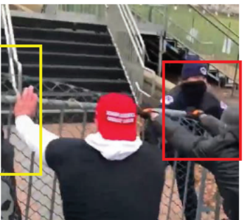
Figure 8. Turning Hat