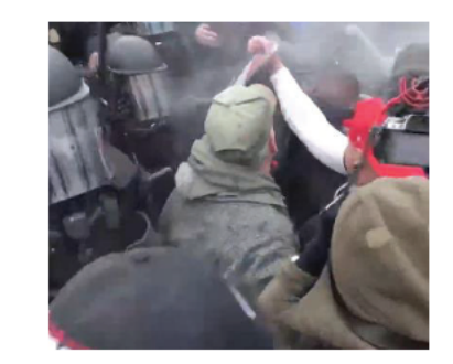
Figure 15. SAMSEL pulling on Riot Shield