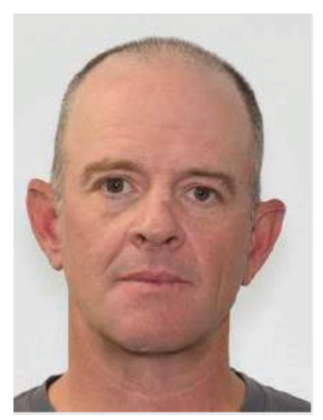
[DRIVER'S LICENSE PHOTOGRAPH]

Moreover, on January 6, 2021, according to an anonymous tipster, MONTGOMERY posted the following photograph to his Facebook page: