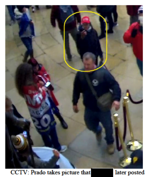
I also observed PRADO on Capitol Building CCTV footage walk through Statuary Hall in the Capitol Building before stopping to use her cell phone to take the second picture later posted on Instagram: