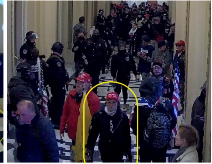
PRADO's physical appearance and clothing in the Capitol Building CCTV footage matched her physical appearance and clothing from the video had posted later that afternoon on Instagram account: