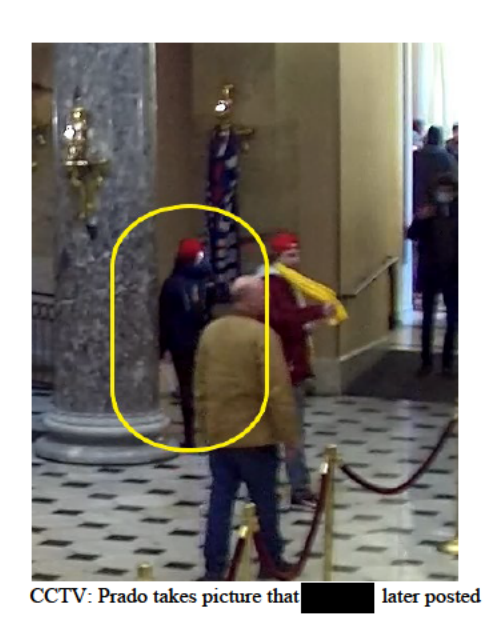
I took several, additional screenshots of PRADO from Capitol Building CCTV footage from January 6,\,2021 :