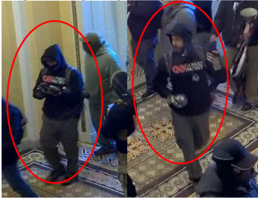
Figure 2. Entering U.S. Capitol Through Senate Wing Doors