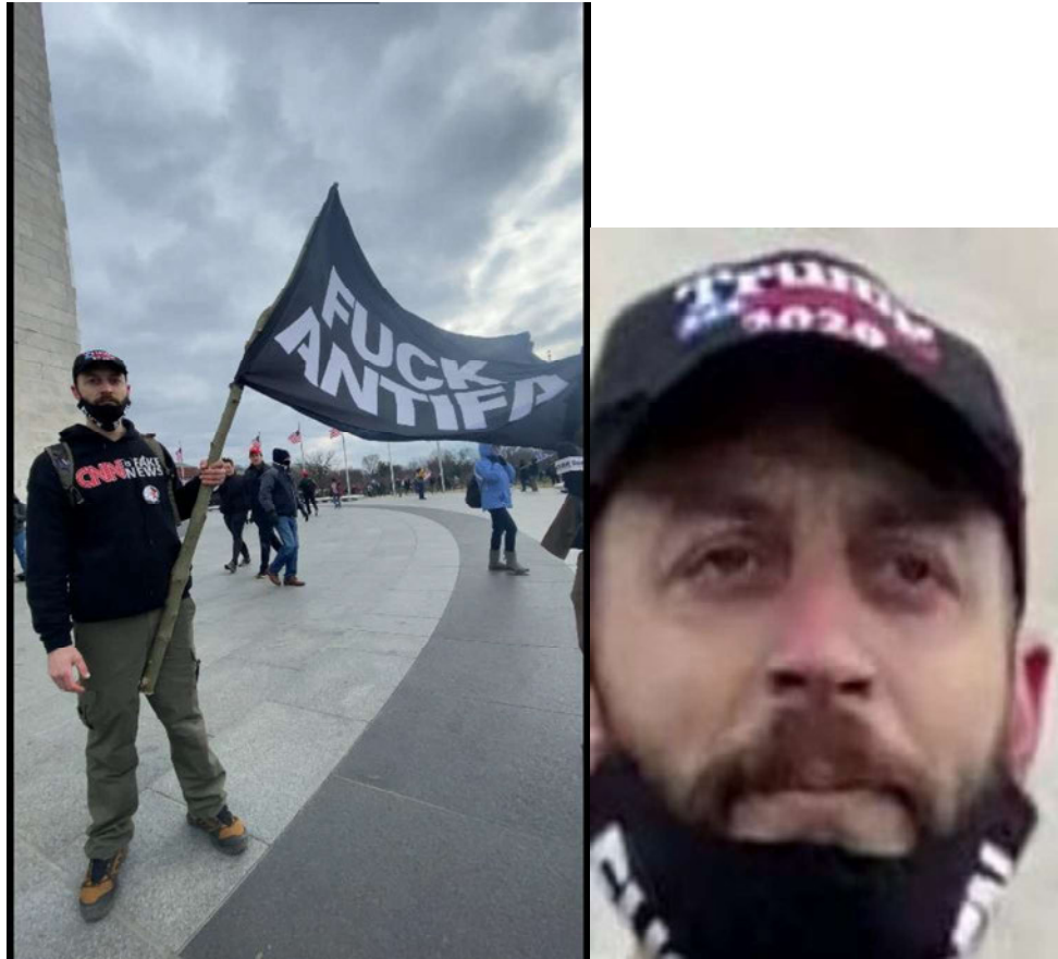
Figure 1. Screenshots Taken from VIDEO 1

Your affiant reviewed United States Capitol Police security footage taken inside the U.S. Capitol on January 6, 2021. Several security cameras observed an individual (SUBJECT 1) matching WARMUS' description from VIDEO 1. SUBJECT 1 was observed entering the capitol at approximately 2:17 PM EST through the Senate Wing Doors as shown in Figure 2. Your affiant has circled SUBJECT 1 in red below.