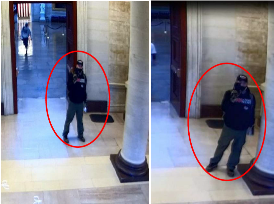
Figure 5. Rotunda Lobby

SUBJECT 1 was also observed using a cellular device to film and/or capture photos. At one point, SUBJECT 1 appears to film protesters attempting to breach Capitol doors through the Rotunda lobby on the east side of the Capitol as shown in Figure 5. An officer who was pulled inside the Capitol through the Rotunda lobby doors, turned, and approached individuals inside the Rotunda and grabbed SUBJECT 1 by the backpack as shown in Figure 6. SUBJECT 1 pulled away and retreated from the officer. The officer then returned to the Rotunda lobby doors, which were fully breached soon after. No audio is provided in the video. Your affiant has circled SUBJECT 1 in red below.