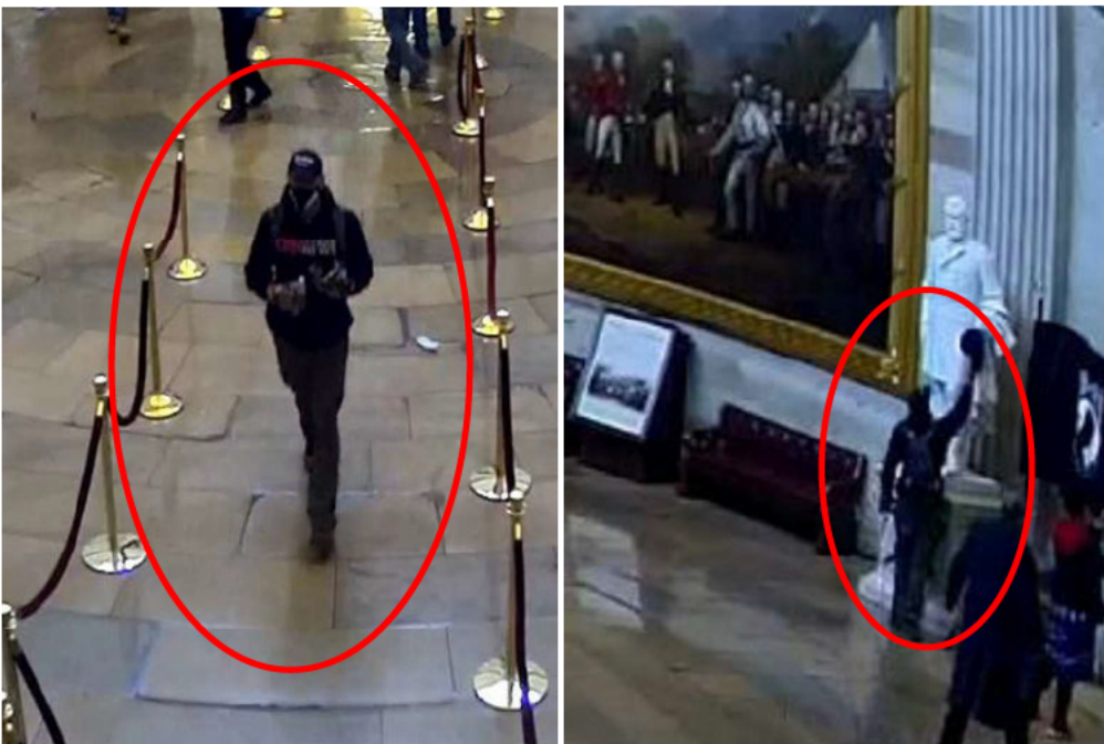
Figure 4. Rotunda

Shortly after, SUBJECT 1 was observed entering the U.S. Capitol Rotunda located on the Second floor at approximately 2:24 PM EST. While inside the Rotunda, SUBJECT 1 was observed walking around and grabbing a dark-colored object off the floor and placing it on a statue as shown in Figure 4. The object is unknown and was on the floor prior to protesters entering the Rotunda. Your affiant has circled SUBJECT 1 in red below.