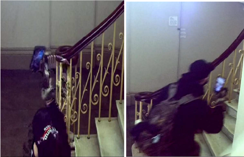
Figure 3. Ascending Staircase

Shortly after, SUBJECT 1 was observed entering the U.S. Capitol Rotunda located on the Second floor at approximately 2:24 PM EST. While inside the Rotunda, SUBJECT 1 was observed walking around and grabbing a dark-colored object off the floor and placing it on a statue as shown in Figure 4. The object is unknown and was on the floor prior to protesters entering the Rotunda. Your affiant has circled SUBJECT 1 in red below.