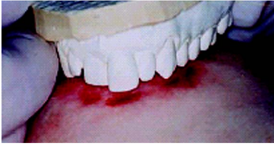
Fig. 2. The Krone case had a senior forensic dentist testifying twice to the positive correlation between these plaster models of the defendant and the injury pattern depicted underneath. DNA proved the defendant was not involved in the murder and rape of the victim.

A forensic odontologist testified at a “preliminary examination” that Otero (2000) (LR16) was “the only person in the world” who could have inflicted the bitemarks at issue. After spending 5 months in jail awaiting trial, the State dismissed the charges after a newly available DNA test excluded Otero as the source of DNA on the victim.