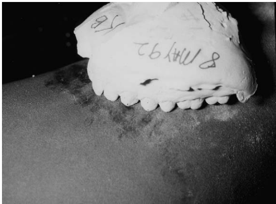
Fig. 3. The State’s use of hard plaster models placed onto decomposed skin of the murder victim. The correlation of the models is zero since there are no discernible teeth marks on the body. Note the similar method of “direct superimposition” that was used in Krone.

2004–2006 has ongoing appellate proceedings in Brewer (LR19) that after conviction uncovered DNA obtained from the decomposed victim indicating two male sexual assault perpetrators. The man convicted for the crime in the early 1990s and sentenced to death was not a contributor to either DNA profile. The only remaining forensic evidence against the defendant is bitemark testimony that the trial county’s District Attorney has indicated is sufficient to try and convict Brewer a second time. An example of the methods and evidence used in this trial is illustrated in Fig. 3.