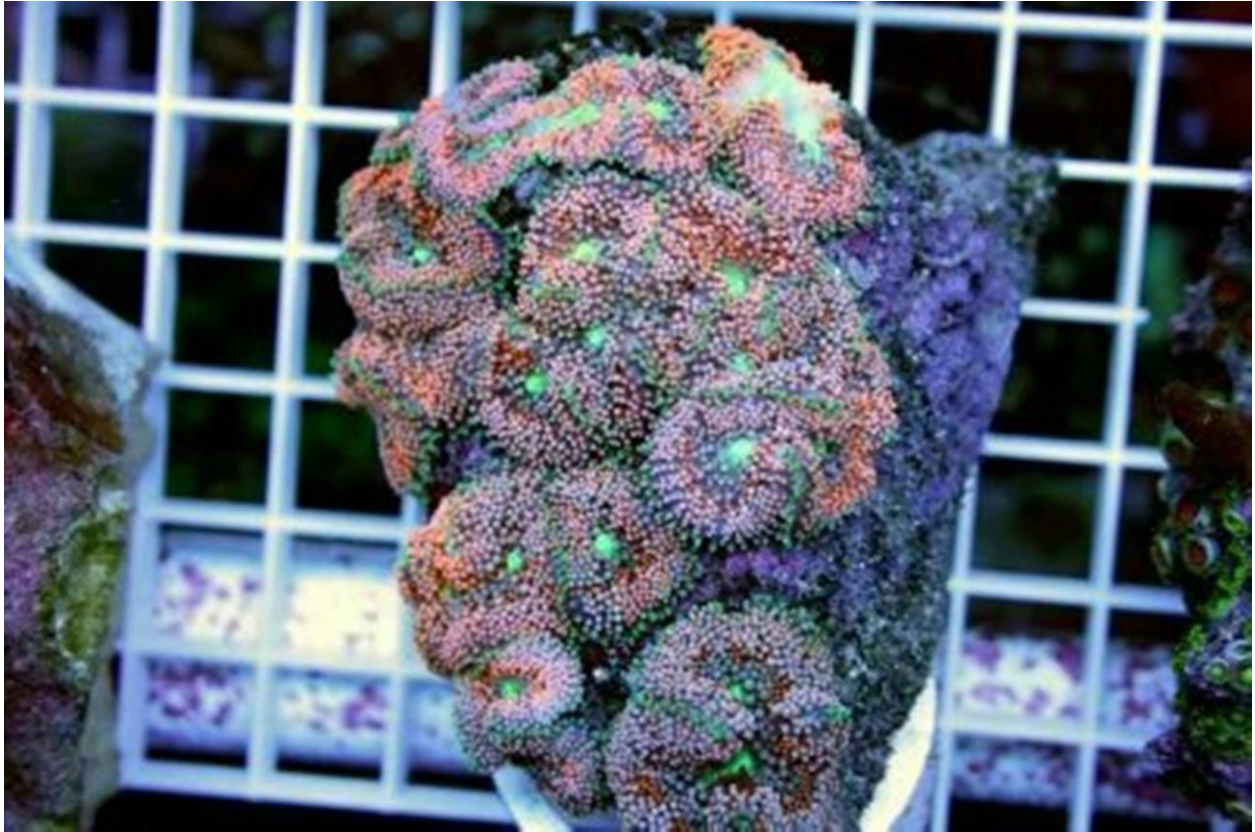
(Above) Ricordea polyps on reef substrate seized from defendant.