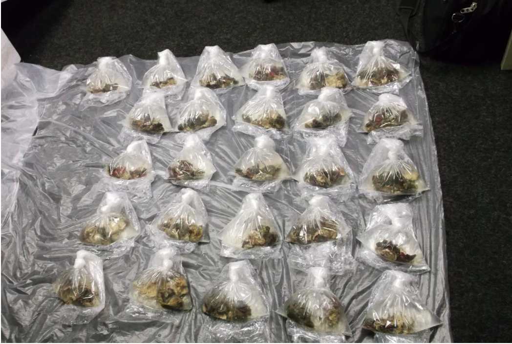
(Above) Ricordea polyps in multiple plastic bags seized June 18, 2015.