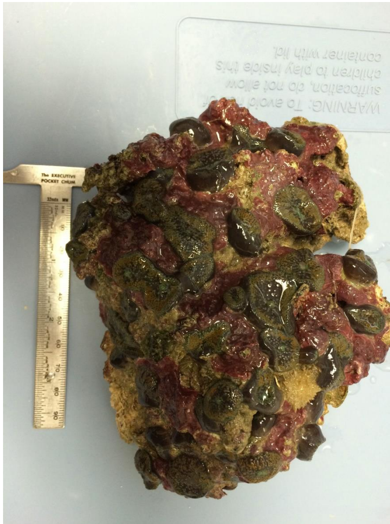
(Above) Chunks of reef substrate with Ricordea attached seized March 2015.