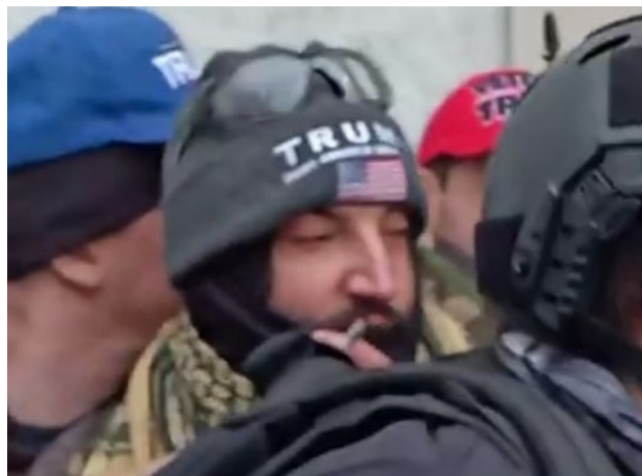
Portion of Figure 5