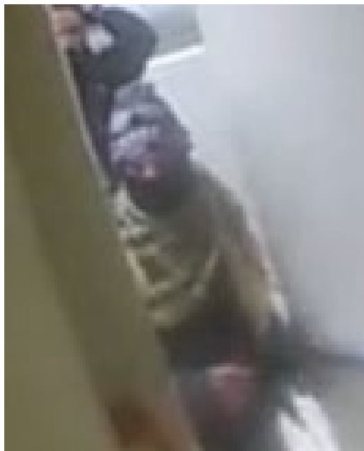
Zoom of Figure 8