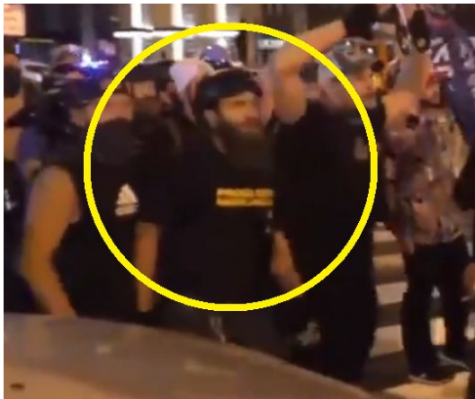
Figure 2: Screenshot of video from December 12, 2020