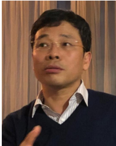
Photograph taken in 2018

Conspiracy to Act in the United States as an Illegal Agent of a Foreign Government