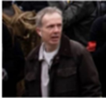
Photograph #294 - AFO J

In an effort to identify the man described above, the FBI released a “Be on the Lookout” (BOLO) photograph to the public, seeking information that might lead to his identification. Below is a photograph released by the FBI, in which the individual was labeled as BOLO 294: