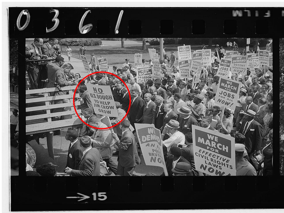
At the March on Washington for Jobs and Freedom, on August 28, 1963, a demonstrator carries a placard calling for the passage of Title VI, "No U.S. Dough to Help Jim Crow Grow."

In 1964, after years of intensive work on the part of civil rights advocates and their supporters in Congress, President Lyndon B. Johnson signed the landmark Civil Rights Act of 1964. Included among the Civil Rights Act's eleven titles is Title VI, codified at 42 U.S.C. § 2000d et seq. In 1963, President John F. Kennedy explained the need for Title VI: "Direct discrimination by Federal, State, or local governments is prohibited by the Constitution. But indirect discrimination, through the use of Federal funds, is just as invidious." Title VI directly addresses the then-common practice of denying certain persons access to federally funded services, programs, and activities based on their race, color, or national origin.