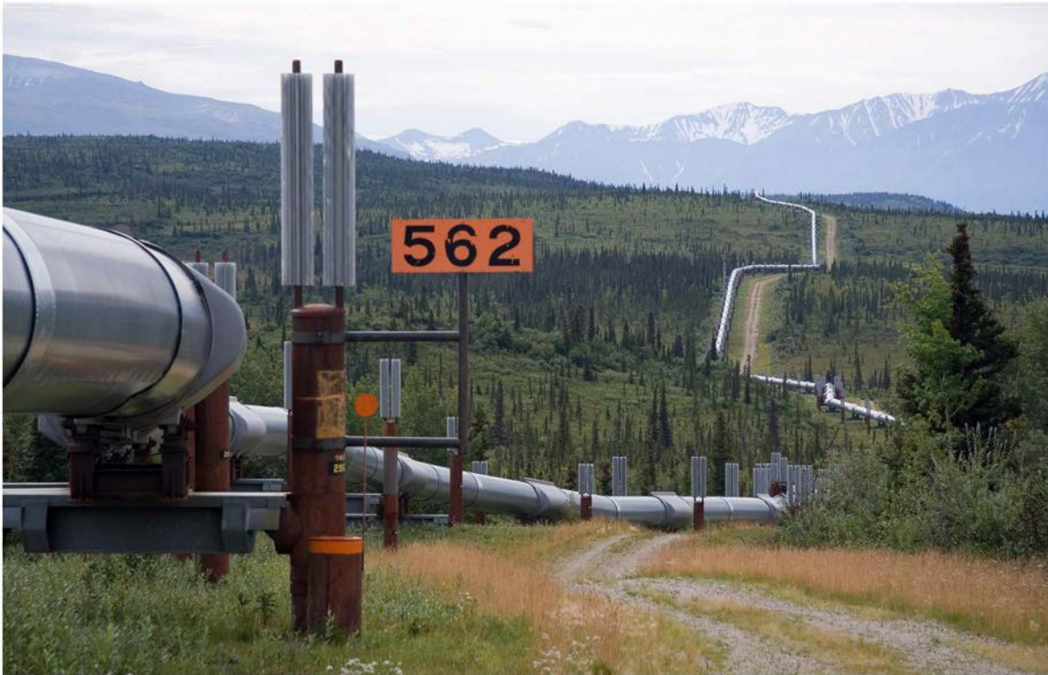
Trans-Alaska Pipeline