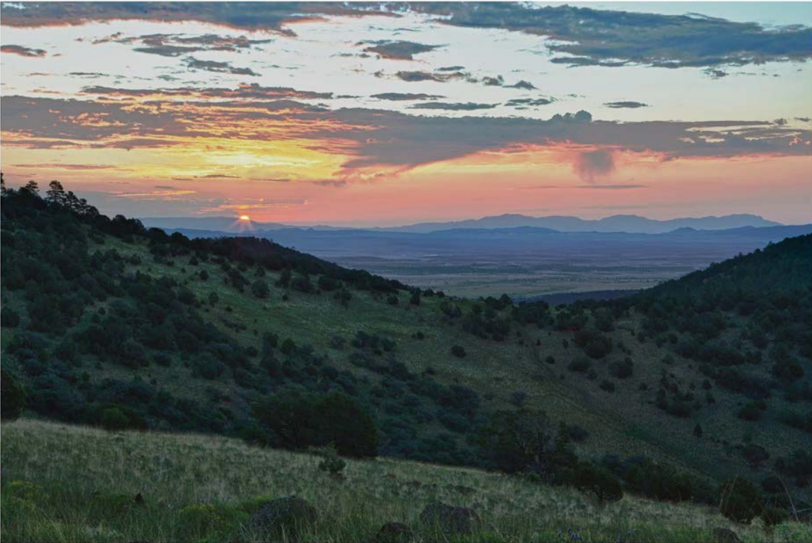
The Continental Divide Wilderness Study Area, New Mexico, Bureau of Land Management