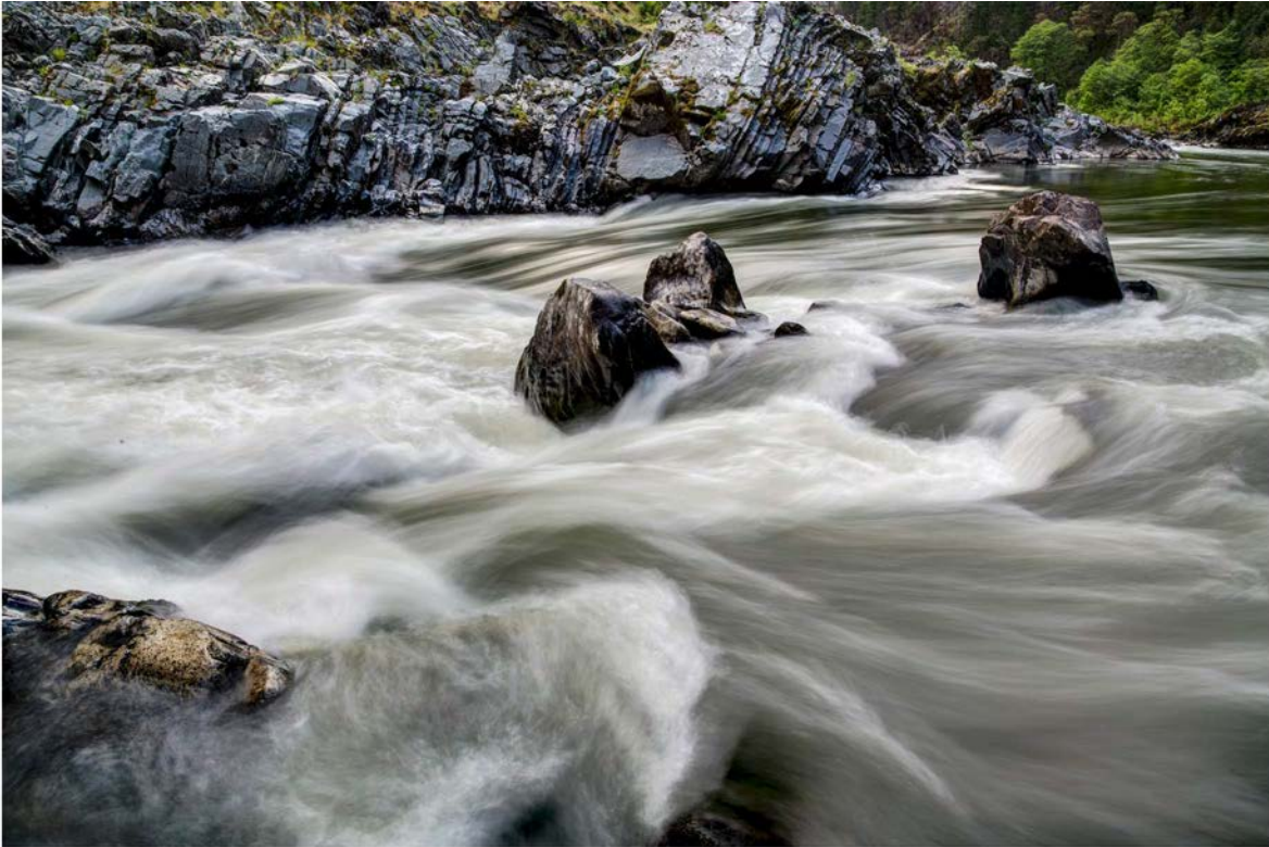
Rogue River, Oregon