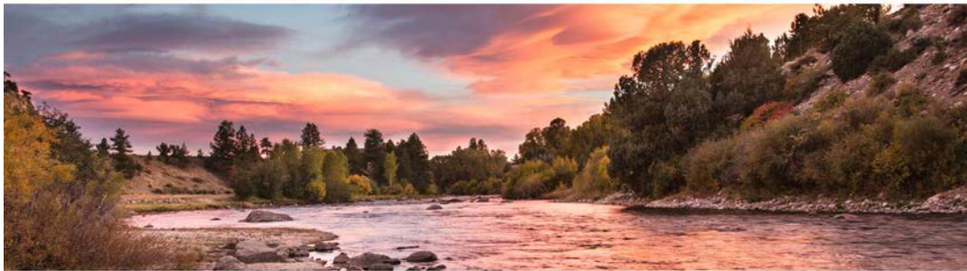
Browns Canyon National Monument, Colorado, Bureau of Land Management