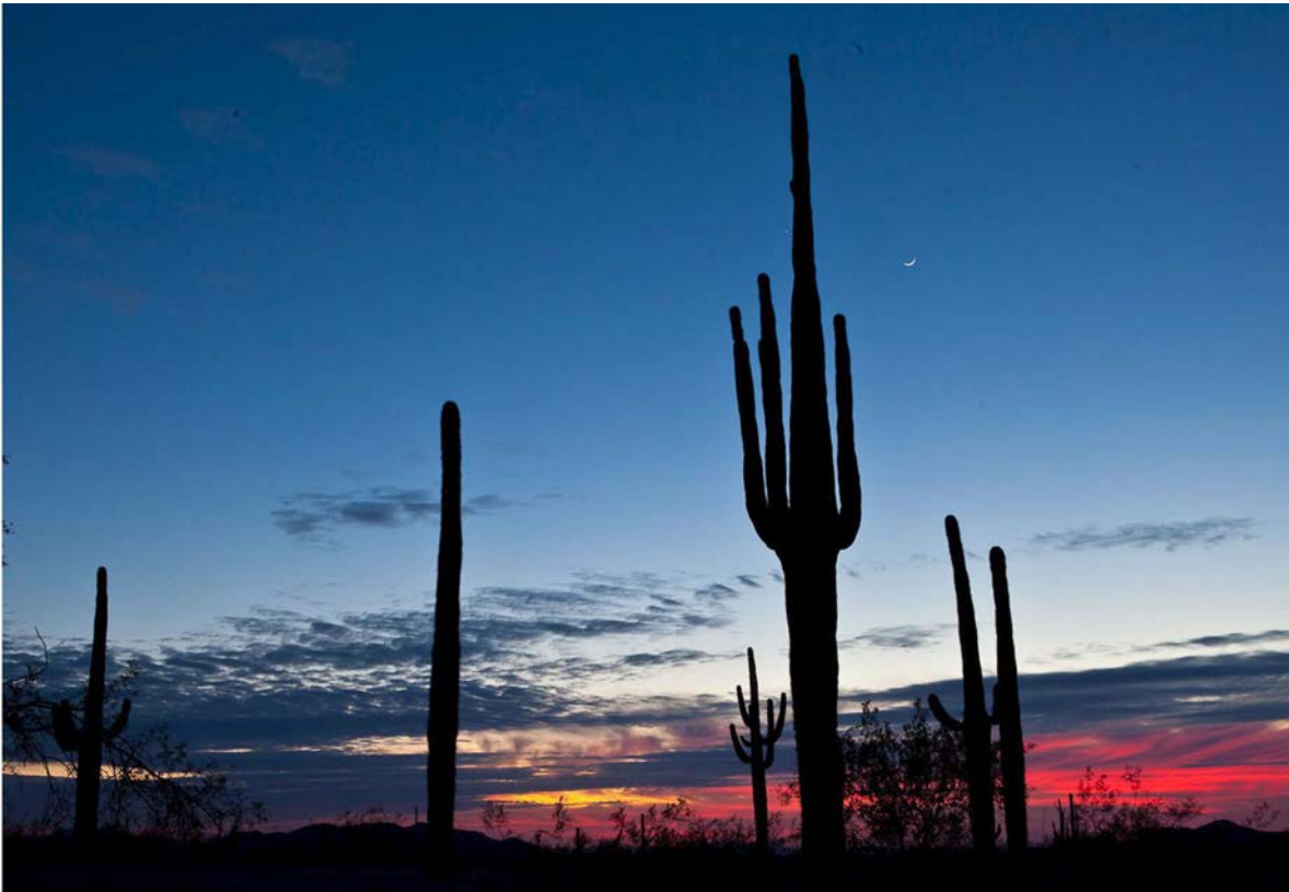
Sonoran Desert National Monument, Arizona, Bureau of Land Management