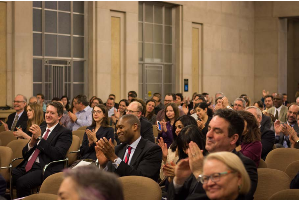
Department of Justice