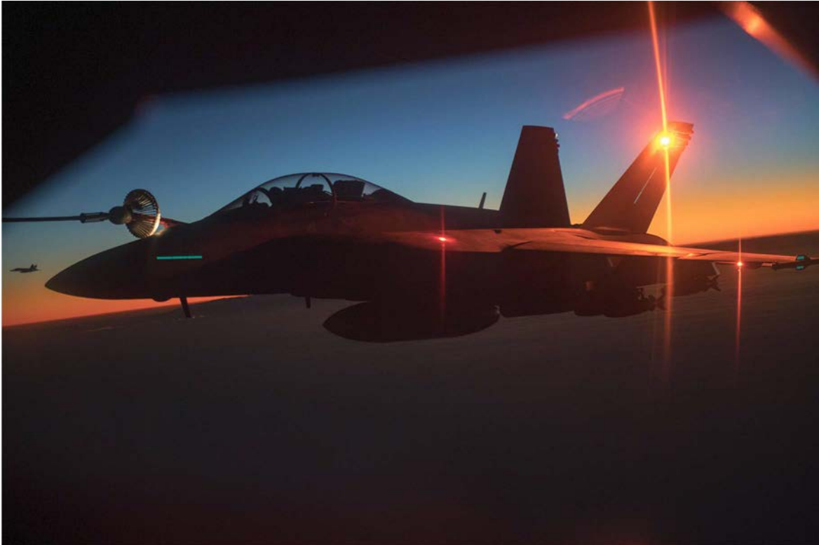
U.S. Fighter F-18, United States Air Force