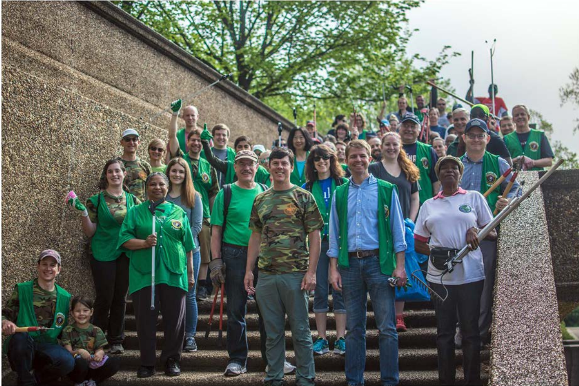
Earth Day, Department of Justice