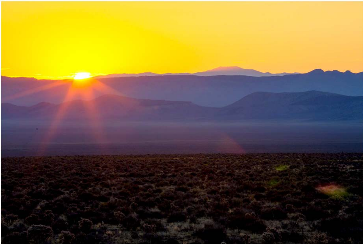
Basin and Range National Monument, Nevada, Bureau of Land Management