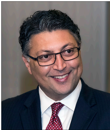
Makan Delrahim Assistant Attorney General

Unlike previous newsletters released during the ABA Spring Meeting, the Division shares this “Spring” Update for 2020 during extraordinarily challenging times. The spread of COVID-19 has affected all aspects of our daily lives, as we face both the public health and economic effects of the virus. As many of us do our part to prevent the spread of COVID-19, however, we were also gripped by the horrifying death of Mr. George Floyd in Minneapolis. My heart is with the peaceful demonstrators who honor the memory of Mr. Floyd by seeking justice and the reforms necessary to prevent similar events in the future.