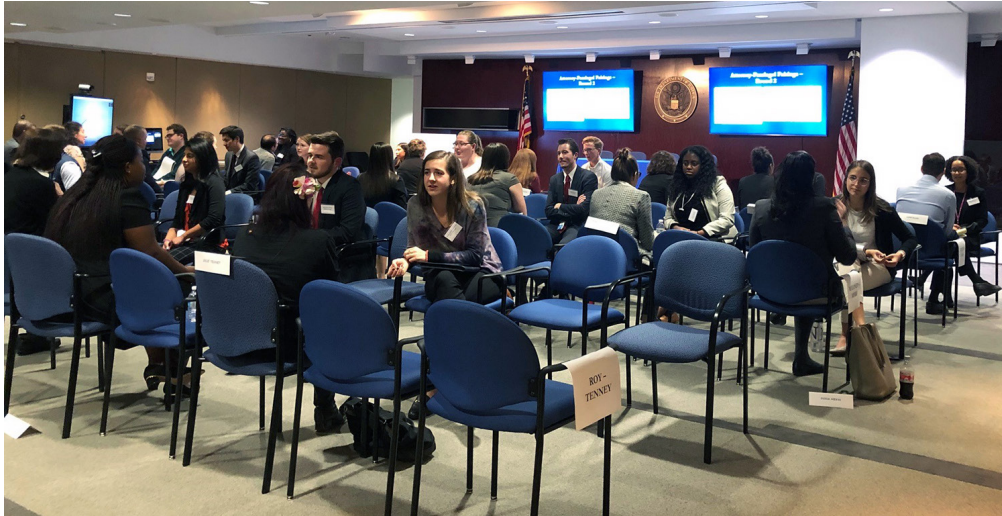
The Paralegal Flash Mentoring Program provided critical connections and career counseling for Division paralegals.

paid parental leave for federal employees.