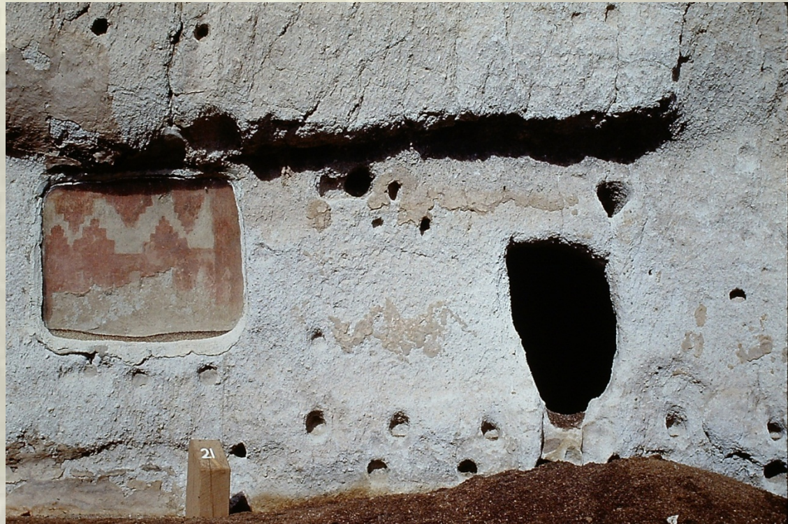
Petroglyphs and pictographs, such as these at Bandelier National Park, often have special meaning to tribal people connected to their past through these places.