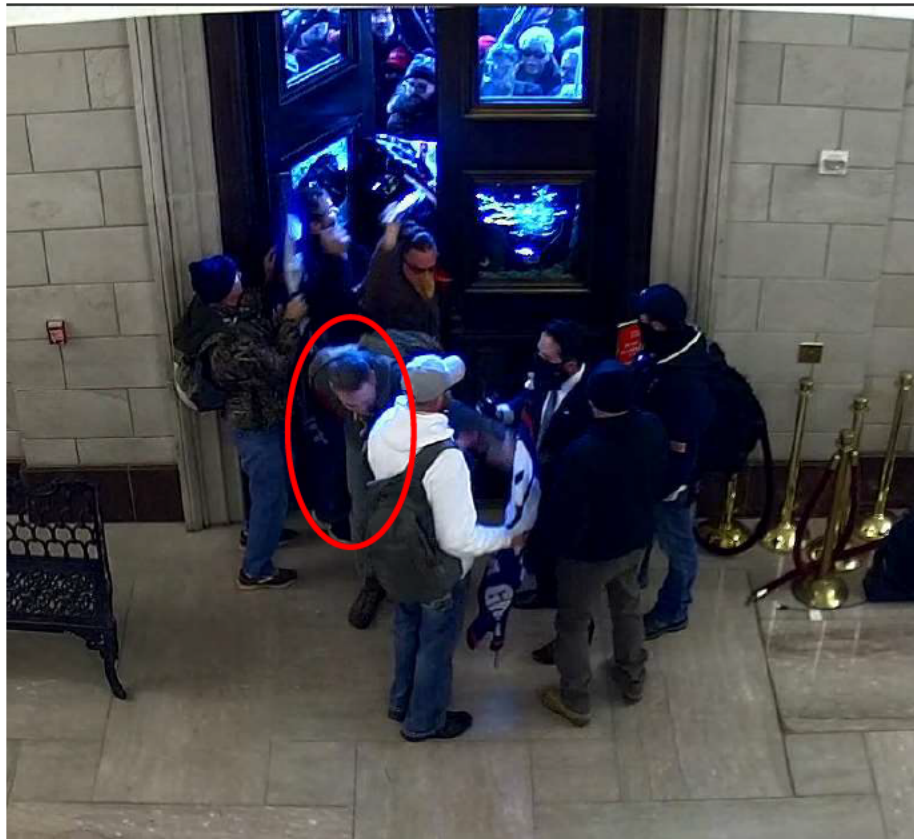
Screen shot of footage from a security camera facing the interior of the east rotunda doors.

As this struggle ensued, the officers gradually lost ground and the crowd of individuals managed to pull the doors open wider and wider. At approximately 2:25 PM, the first individual pushed himself through the East Rotunda doors and into the Capitol. The subject was wearing a dark jacket with bright green zippers, a military green backpack and black and tan gloves. He had short, dark hair which was trimmed to the skin along the edges of his hairline. Images of this subject would subsequently be posted to the FBI website Capitol Violence page and given the designation of BOLO-241-AFO (hereinafter "241-AFO").