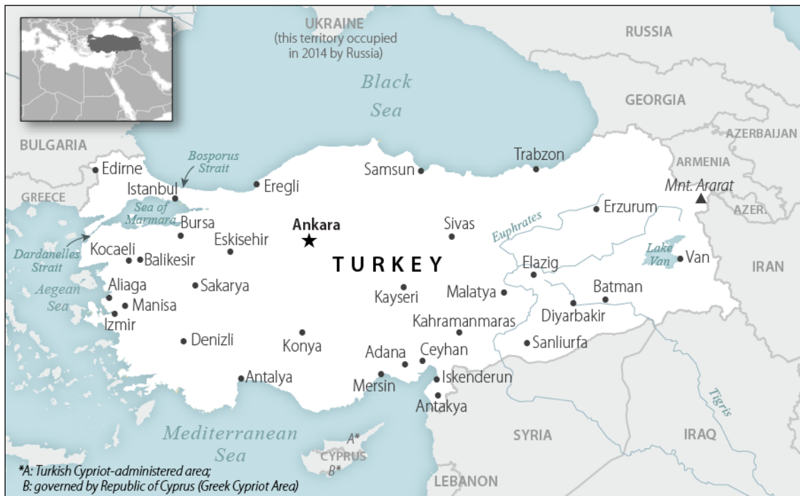
Figure I. Turkey at a Glance