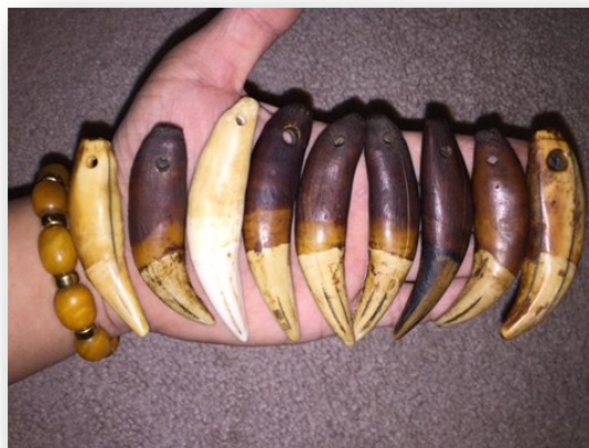
Lion and tiger claws