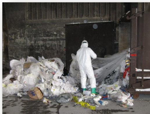
Execution of search warrant

In February 2014, one or more company employees placed large sheets of plastic containing hazardous chromium waste into a