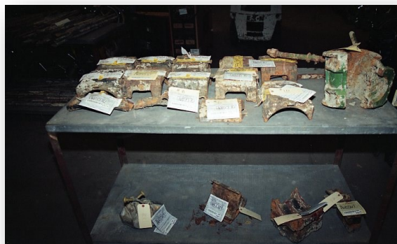
Rail car parts retrieved from the water

United Industries, LLC, (UI), a subsidiary of Progress Rail Services, Inc., which is a subsidiary of Caterpillar, Inc., is a company that inspected and repaired railcars for various railcar owners and operators at multiple repair facilities throughout the United States, including Terminal Island, California, in the Port of Long Beach.