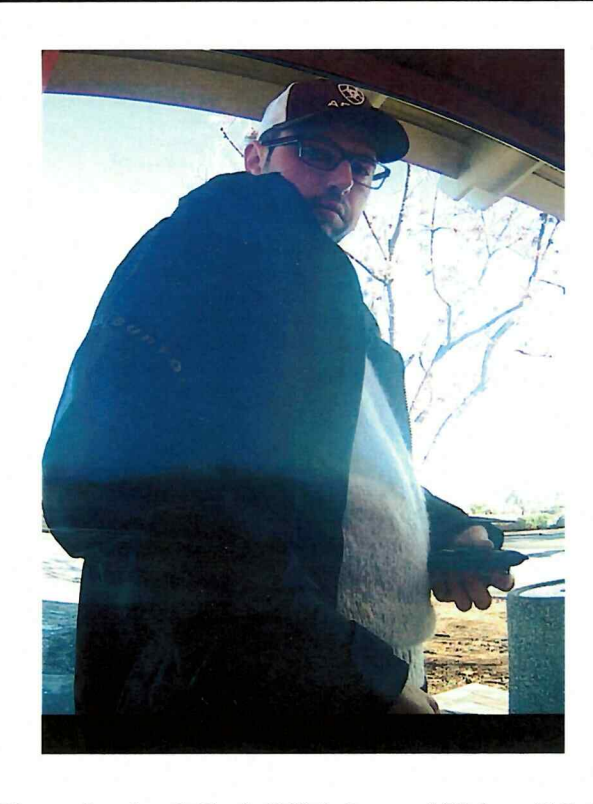
January 1, 2023, Unauthorized Cash Withdrawal Using C.L.'s Information