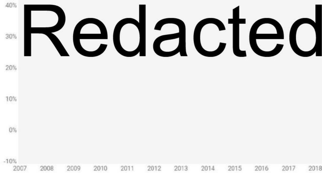
[TOTAL] Query & RPM contribution to total G.com Y/Y revenue growth

1 Monetisation gains now driving majority of revenue growth