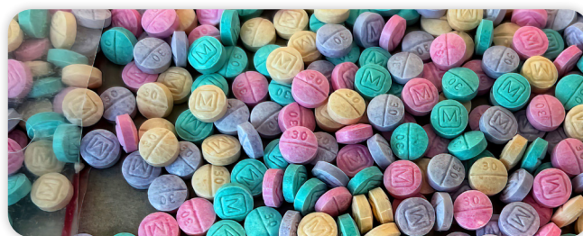
*FAKE rainbow oxycodone M30 tablets containing fentanyl