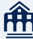
Office of Equal Opportunity