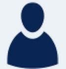
District Equal Opportunity Coordinator