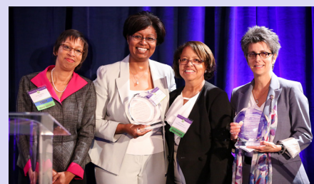
National Legal Aid and Defender Association Award

In recognition of WH-LAIR's collaborative efforts, two civil society organizations have bestowed prestigious awards on WH-LAIR: the 2014 National Legal Aid and Defender Association's Justice Through Government Service Award and the 2016 National Center for Medical-Legal Partnership's Medical-Legal Partnership Leadership Award.