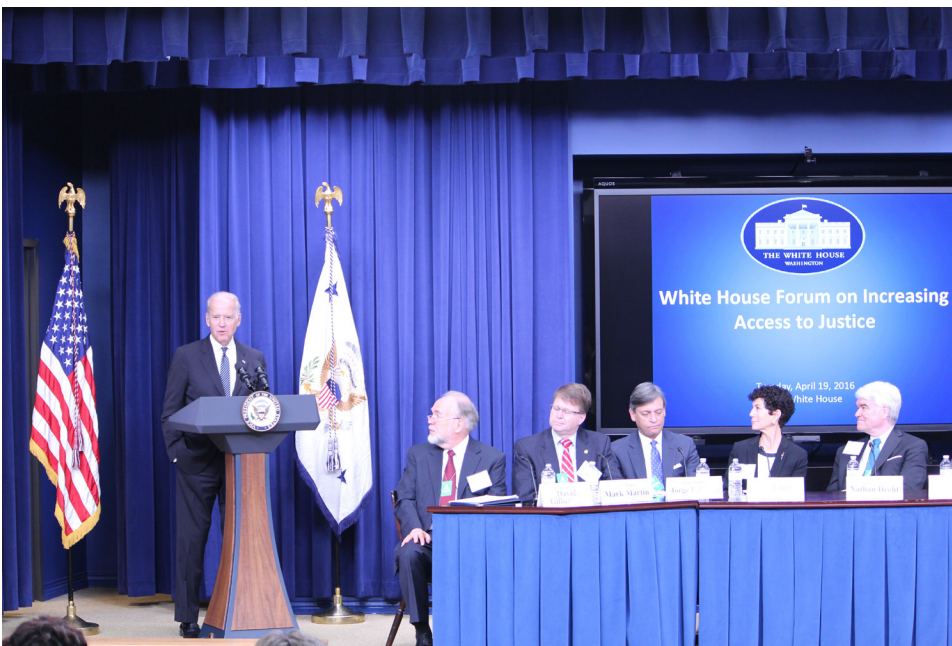
Vice President Joe Biden speaks at the April 19, 2016 White House Forum on Increasing Access to Justice.

“ Research tells us that effective legal representation is the single most important factor in whether victims are able to escape this domestic violence cycle. Yet, studies estimate that less than 1 in 5 low-income victims of domestic violence ever get to see a lawyer.