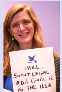
Ambassador Samantha Power

~President Barack Obama September 27, 2015 United Nations Sustainable Development Summit