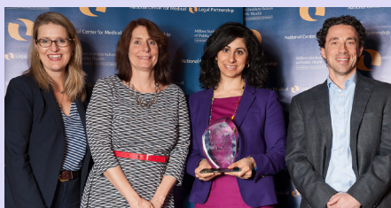
National Center for Medical-Legal Partnership Award

Working with Civil Society. As documented in Appendix B, WH-LAIR has presented on its goals and activities and how legal aid helps to address national problems like elder abuse and consumer fraud to a number of civil society organizations. WH-LAIR agencies also held listening sessions and gathered information about legal aid's role in disaster response and affordable housing. Additionally, civil society consultations with access to justice experts have served a valuable role in helping WH-LAIR agencies understand their views.