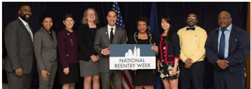
Attorney General Loretta Lynch and HUD Secretary Julián Castro with DOJ staff and Community Legal Services of Philadelphia staff and clients during National Reentry Week, April 25, 2016