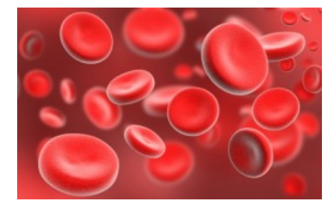
Figure 1: Red Blood Cell

White blood cells are nucleated cells<sup>9</sup> that are present in blood and their primary function is immunological. Whole blood has approximately 5,000 - 10,000 white blood cells per microliter and they are larger than red blood cells.<sup>10</sup> Platelets are small detached cell fragments that adhere specifically to the cell lining of damaged blood vessels, where they help repair damage and initiate blood clotting.