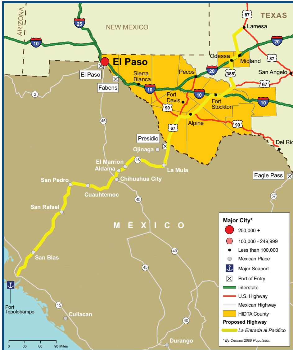
Figure 2. La Entrada al Pacifico.

Mexican Government has switched its emphasis to a new border road project that would construct a highway from Presidio to Del Rio as well as all along Mexico's northern border. Construction of this roadway will give DTOs better access to long stretches of the border where currently there are only rough or nonexistent roads.