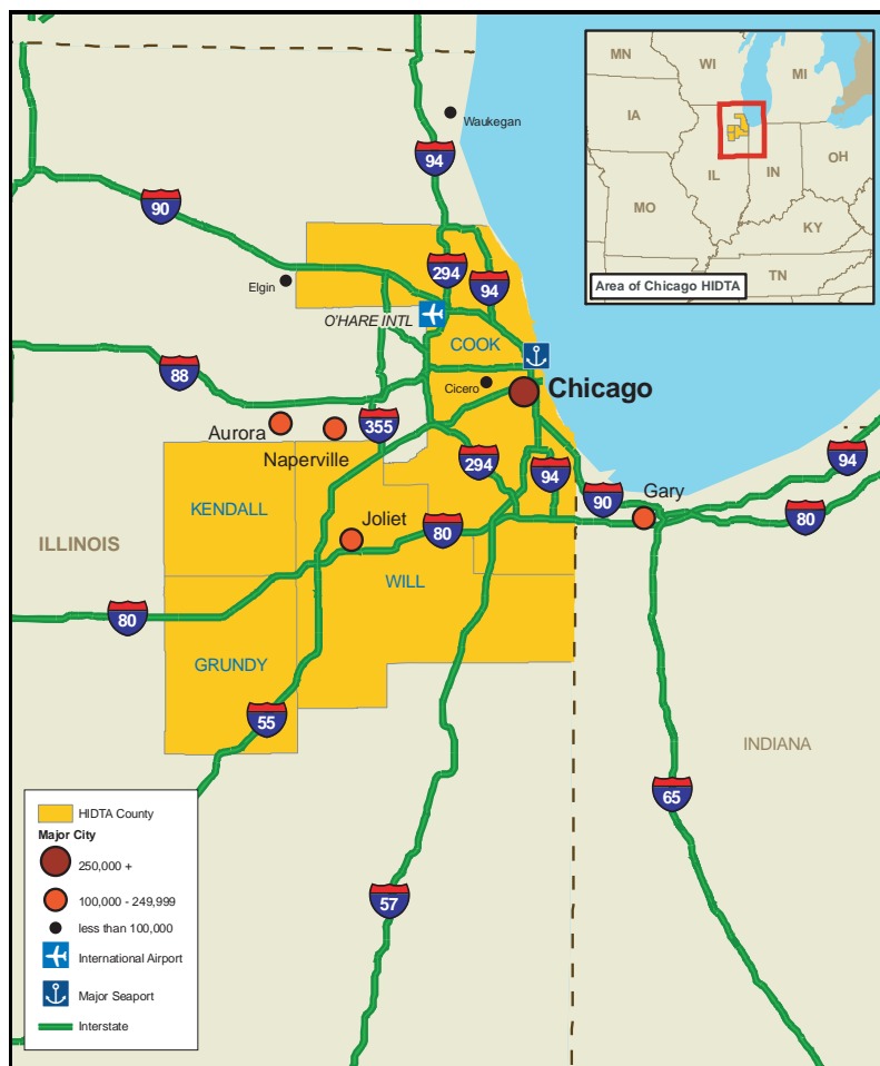
Figure 1. Chicago High Intensity Drug Trafficking Area.

recent law enforcement reporting, information obtained through interviews with law enforcement and public health officials, and available statistical data. The report is designed to provide policymakers, resource planners, and law enforcement officials with a focused discussion of key drug issues and developments facing the Chicago HIDTA.