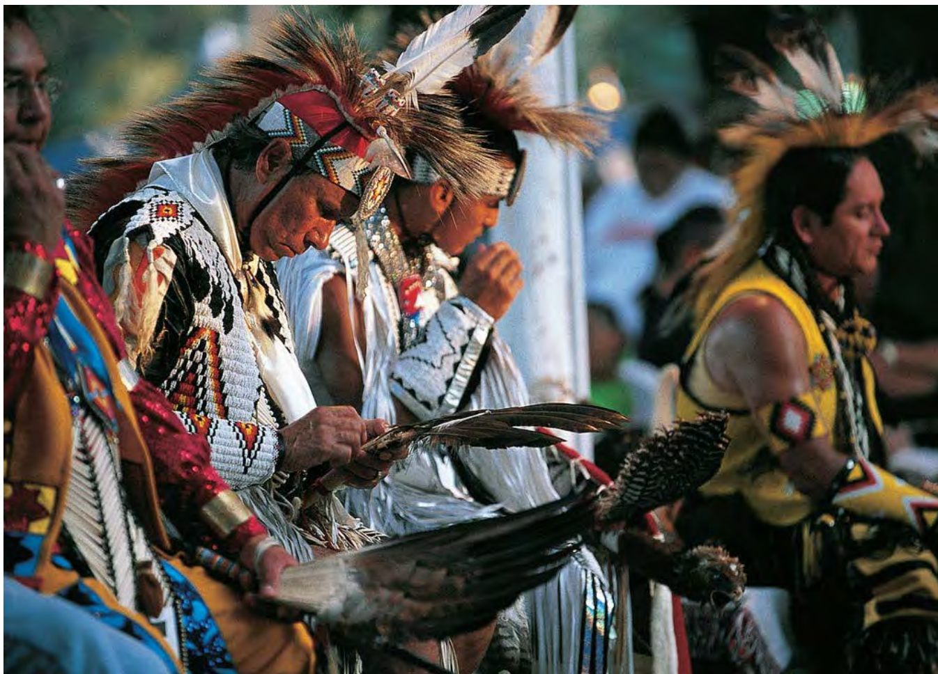
Omaha Tribe's Annual Harvest Celebration is held every year during the first full moon in August.